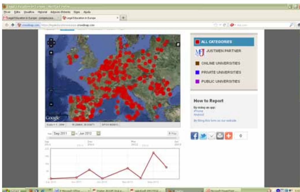
Fig. 2. Screenshot from the EU education crowdsourced map.

Another step in the same direction is the Stanford Project on constitutional tagging. 90 Its main goal is to construct the Constitution Explorer , a structured database of Constitutions to enable people to compare and contrast Constitutions from other countries. Rather than going manually through the text, semantic searches are enabled by a legal taxonomy. This is an object of collaborative design through mindmaps. Volunteers from different countries review and complete the taxonomy, tagging and annotating national Constitutions with relevant cases. Students from the UAB Law School (alongside students from Stanford and the University of Edinburgh) performed this task on November 12 th 2011. 91 This is an example of creative academic endeavour in which more than one-hundred students communicated in different languages to reflect on the conceptual difficulties of comparative constitutional law. We discovered that discussions in cross-cultural and political tagging are analogous to expert discussions in ontology building. In both cases, cross-fertilization and contrasting opinions helped to create an added-value in learning from the existing materials.