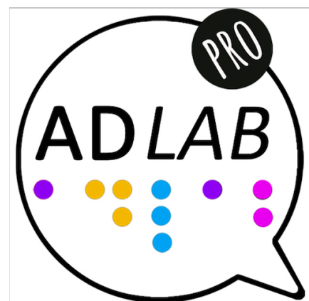
Audio Description: A Laboratory for the Development of a New Professional Profile

Full participation of all citizens in cultural events - as end users or participants - should become part of their daily life as for people without disabilities, restoring the concept of equal opportunity and Human Right of access to culture.