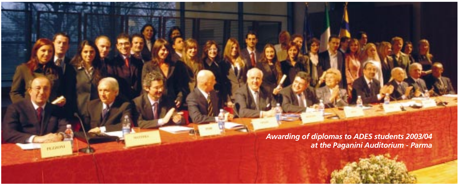
Awarding of diplomas to ADES students 2003/04 at the Paganini Auditorium - Parma