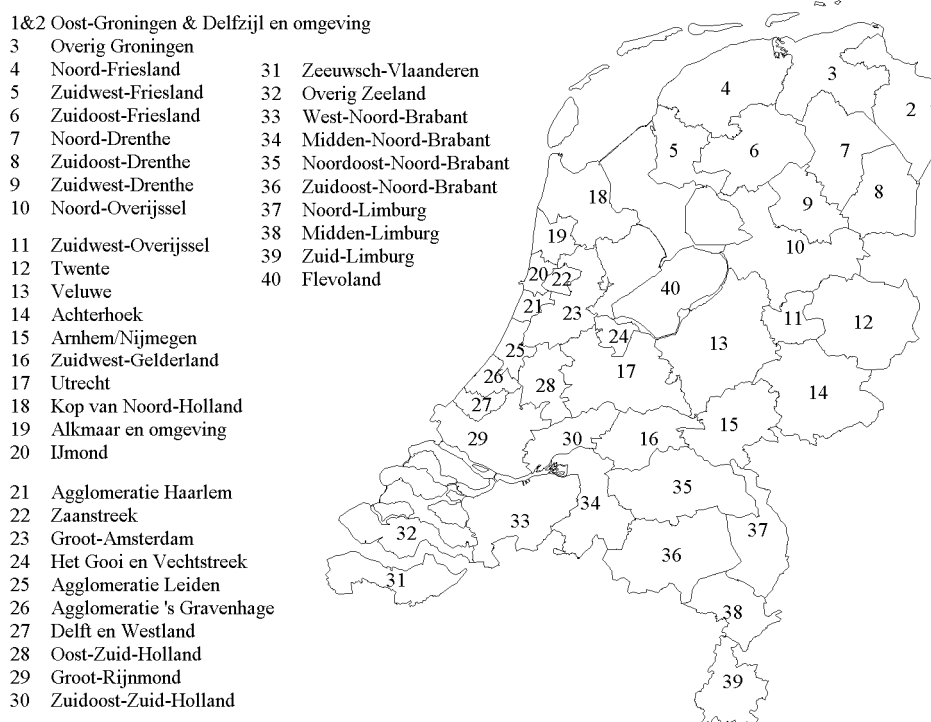
Figure 1: Map of the regions used in the study

The analysis is split into three parts. First, we describe the regional differences in the gender gap in life expectancy for the early 1980s and late 1990s and the age groups and causes of death that were responsible for these differences. Next, we test cross-sectionally for the two periods our assumption that the emancipation of Dutch women in work and social life outside the family has been detrimental to their health. This is done by analysing the association between regional differences in the gender mortality gap and regional differences in gender-inequality-related factors that have been selected from the theoretical framework developed by Waldron (2000). We finish our analysis by investigating changes in regional gender differences over time. A map of the regions that are analysed is given in Figure 1.