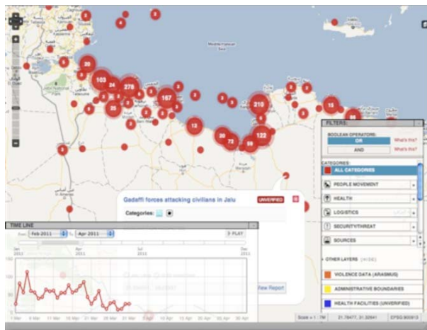
Screenshot of the Libya Crisis Map used in different presentations by Standby Task Force members.

Automatic processes can be applied to extract, filter and structure content from social media – tasks that are currently performed by human volunteers.