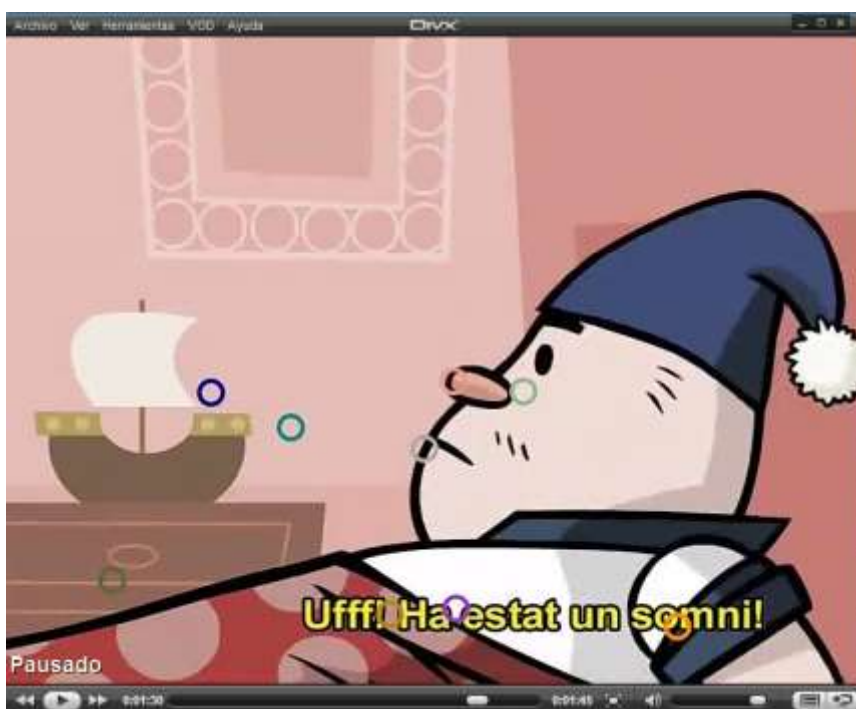
Figure 3. Visual attention of the participants in the sample measured with the eye-tracker in the final sequence of the story.

In order to illustrate these results, we show an example of the data gathered with the eye-tracker (see Figure 3) which reveals how, in the ending sequence in the story The Pirate Treasure , there were subjects (each represented by a different-coloured circle) who did not read the subtitles and instead directed their attention to the image.