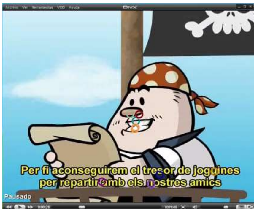
Figure 4. Visual attention of the subjects on the lips in a image from the video with subtitles, as measured with the eye-tracker. Each participant represented by a different coloured circle.

cartoon, despite the fact they cannot lipread. This is possibly due to the fact that even though they cannot lipread syllables, they still read mouth movements that suggest when the characters are actually speaking. This took place in both the sequences with subtitles ( M = 174.09 ; SD = 66.57 ) and in those without subtitles ( M = 124.45 ; SD = 59.84 ). However, the children with a higher reading speed and a higher level of reading comprehension (children 6, 7, 9 and 11) show a clear tendency to watch the characters' lips less than the other participants (see Figure 4).