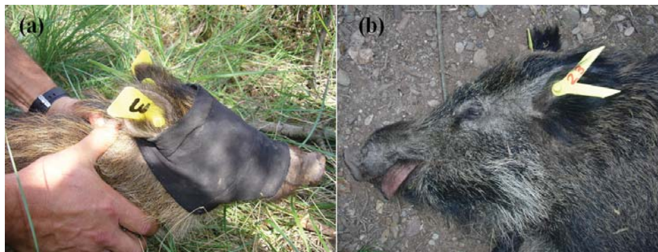
Fig. 1: Wild boars captured: (a) Piglet female #3; (b) Subadult female #23.

Six wild boars released as piglets or subadults (Fig. 1) were hunt harvested or collected after a road accident at an average of 45.8 km from the capture location (min. = 30, max. = 89.8, Table 1 and Fig. 2).