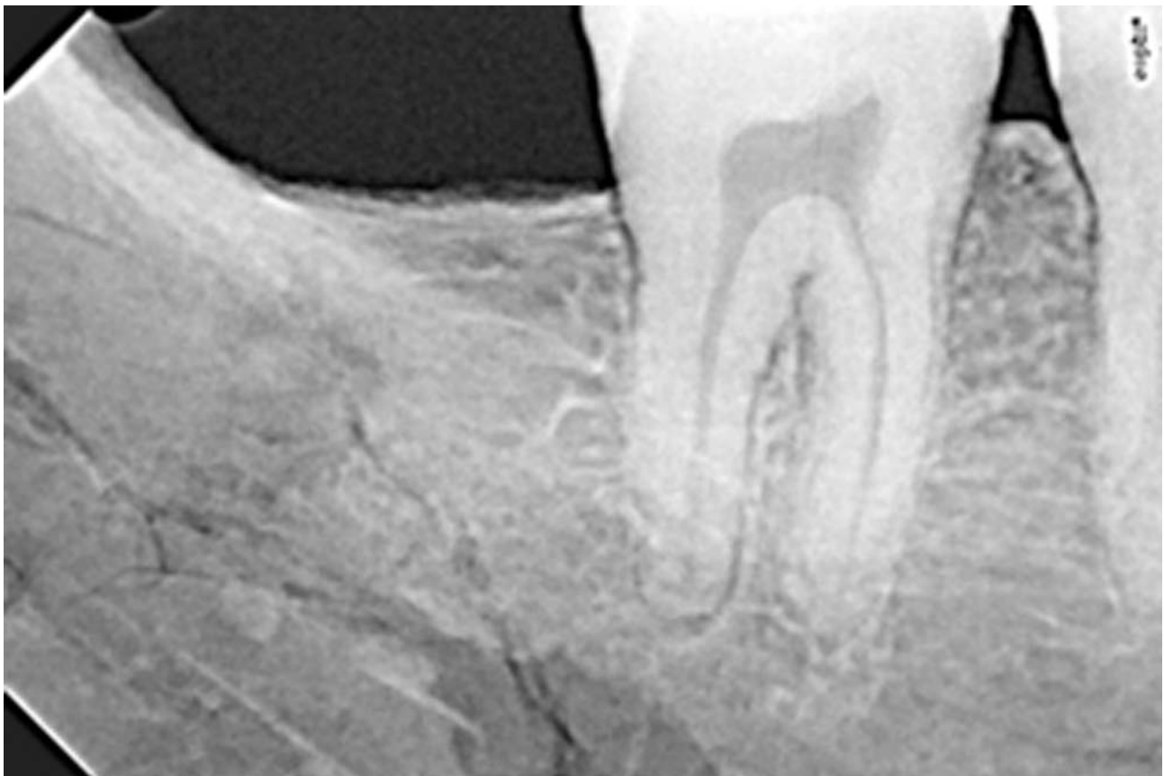
FIGURE 1: Radiograph of the roots of the left second molar and the third molar agenesis.

The individual come from the grave CR-16.1 that contained a single skeleton buried in a supine position with the upper limbs crossed above the abdominal region. No grave goods were found inside the burial. Although almost the entire skeleton was present, the state of preservation was poor. The ribs were incomplete and damaged, and the total chest wall could not be reconstructed.