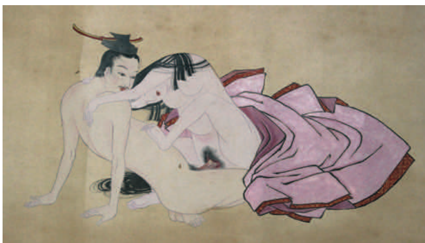
Figure 5. Erotic handscroll by Kanō Motonobu copied by Kanō Eisen'in (section). Second half of the eighteenth century. Painting on paper. 36 x 1893.4 cm (full size). Mito Tokugawa private collection.

time (Figure 9). 17 Bearing in mind that both the painting by Eisen'in kept by the Tokugawa and the copy in the National Museum are complete and almost identical, each accompanied by a note specifying that they are copies of a handscroll by Kanō Motonobu ( Kohōgen ), we can deduce that they are two faithful renderings of Motonobu's original shunga work. The incomplete handscroll copied by Tōun features eleven scenes. Four are identical to those that appear in the two complete copies, while the other seven are quite different. That Kanō Tōun's copy differs somewhat from the one in the Tokyo National Museum and the one from the Kanō Eisen'in in the possession of the Tokugawa should not surprise us, given the artistic practice of the time particularly as regards the production of erotic scrolls. In fact, following what was common practice in the early-Edo period, Kanō Tōun took inspiration from Motonobu's work in order to produce a different scroll, probably using one or more additional sources. Just as sixteenth- and seventeenth-century erotic handscrolls regularly depicted figures in scenes and positions that were already known, with minor changes based on a preestablished iconographic tradition, so the erotic scenes copied by Eisen'in based on Motonobu's original can be found repeated in similar ways in other paintings that can be