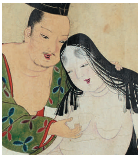
Figure 9. Erotic handscroll by Kanō Motonobu copied during the Edo period by an unknown Kanō artist (detail). Painting on paper. Tokyo National Museum.