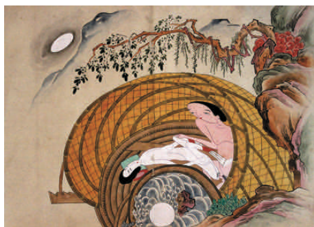
Figure 3. Saya-e erotic handscroll (section). Mid-eighteenth century. Painting on paper. 37 x 1127.7 cm (full size). Mito Tokugawa private collection.