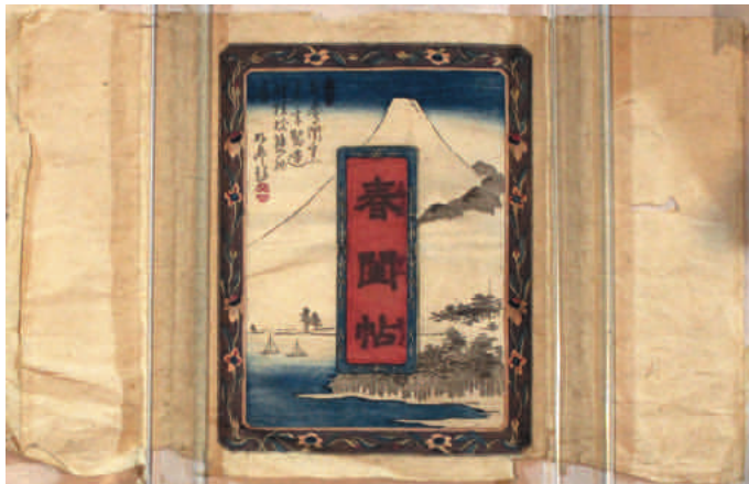
Figure 16. Shunkeichō wrapper. c. 1820–1830. Colour woodblock print. 25.5 x 40.5 cm. Mito Tokugawa private collection.

point, the Tokugawa family turned the fukuro-e cover from the erotic book Shunkeichō attributed to Yamaguchi Shigeharu into the cover for a French erotic print. 38