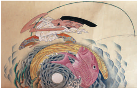
Figure 1. Morita Kōun. Shichifukujin. Saya-e handscroll (section, Ebisu). Mid-eighteenth century. Painting on paper. 40.5 x 1105.8 cm (full size). Mito Tokugawa private collection.