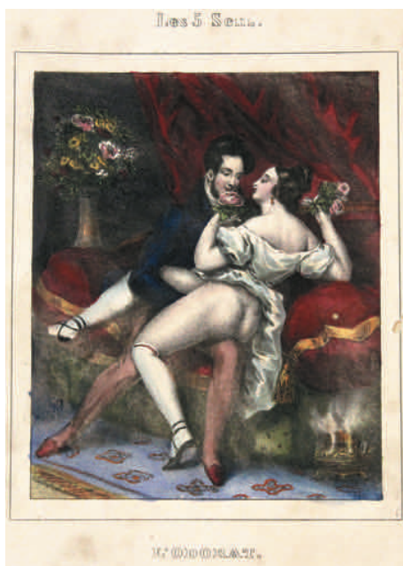
Figure 17. L'odorat , color lithography from a set of five prints entitled Les 5 Sens , c. 1830. 27 x 18 cm. Mito Tokugawa private collection.

is obvious as the woman is depicted without undergarments, leaning over the man, who grips her thigh in a clear gesture of desire.