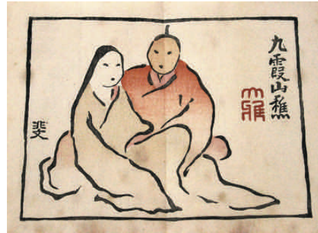
Figure 12. Erotic scene reproducing an original painting by Ike no Taiga. 1814. Color woodblock printed book. 15.8 x 10.6 x 0.7 cm. Mito Tokugawa private collection.

The oldest datable version of the Haru tsurezure is in the hands of the Mito Tokugawa family, and includes an important preface. The work is a small orihon edition of which only two copies are known to us today, and which contains nine double page woodblock printed illustrations based on a painting by Ike no Taiga. 33 The edition includes a preface dated 1814 ( kinoe inu 甲戌) and signed by one Shimotsuke Ayaru 下野あやる (unidentified). According to this note, the erotic scenes reproduced in the album were copied from an original painting by Ike no Taiga found in the secret collection of a noble house. We do not know, however, whether or not this mention of a “noble house” ( kōki no ie 高貴の家) refers to a member of the Tokugawa family circle (perhaps someone from Shimotsuke province?). In any case, shortly after its publication in 1814, this work was acquired by the daimyo Tokugawa Narinobu and, later, was kept in a wooden box with a note by Tokugawa Nariaki identifying it as a shunga by Ike no Taiga.