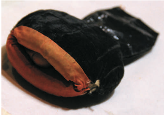
Figure 13. Artificial vagina azumagata , also known as gyokumongata , included in the set of sex toys. First half of the nineteenth century. Mito Tokugawa private collection.