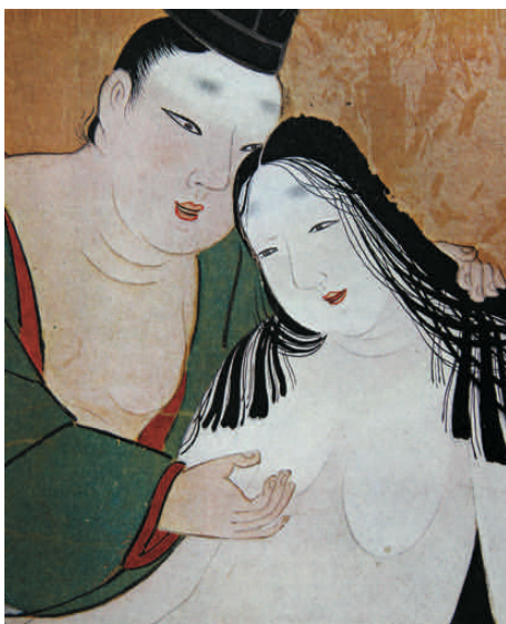
Figure 6. Erotic handscroll by Kanō Motonobu copied during the Edo period by Kanō Tōun (detail). Painting on paper. Private collection. Reproduced from Lane 1979.