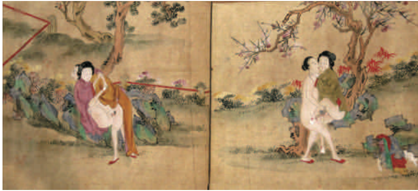
Figure 10. Chinese erotic album. Late-seventeenth century–first half of the eighteenth century. Painting on silk. 25.6 x 22 x 0.8 cm. Mito Tokugawa private collection.

books and works of Chinese art. Among these is an erotic album of paintings on silk (Figure 10) kept together with a note by Tokugawa Nariaki stating the provenance to the daimyo Tokugawa Harumori ( Bunkō sama o shina no yoshi 文公様お品のよし). With a history going back more than two thousand years, Chinese erotic art ( chūnhuà 春画) was well-known in Japan, where it had circulated in the form of sex manuals, medical texts, and illustrated handscrolls since the Nara 奈良 and Heian 平安 (710–1185) periods. The impact of these works on Japanese art is evident during the Edo period, which coincides with the late-Ming 明朝 (1368–1644) and early-Qing 清朝 (1644–1912) periods. 24