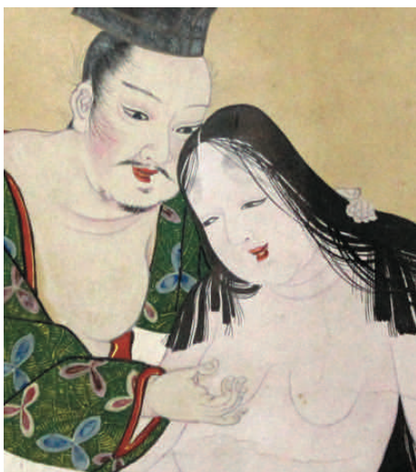
Figure 8. Erotic handscroll by Kanō Motonobu copied during the second half of the eighteenth century by Kanō Eisen'in (detail). Painting on paper. 36 x 1893.4 cm. Mito Tokugawa private collection.