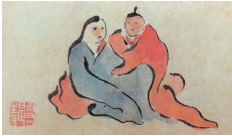
Figure 11. Ike no Taiga, Haru tsurezure , c. 1770. Private collection. Reproduced from Ujiie 1978a.