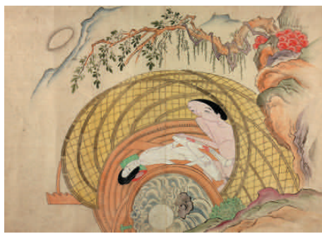
Figure 4. Saya-e erotic handscroll (section). Mid-eighteenth century. Painting on paper. Private collection.

into China by the Jesuits and later was transferred to Japan, probably by both the Dutch and the Chinese. In this context, we can assume that the specific case of the erotic handscroll in the Tokugawa collection was painted in Japan during the mid-eighteenth century based probably on Chinese models. 11