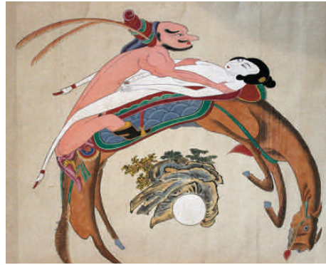
Figure 2. Saya-e erotic handscroll (section). Mid-eighteenth century. Painting on paper. 37 x 1127.7 cm (full size). Mito Tokugawa private collection.

Jurōjin 寿老人, Benzaiten 弁才天, an image of a mythical palace called Hōraigū 宝来宮 and, finally, there is the title, the signature of Morita Kōun, and the expression kawarrie (カハリエ, lit. “strange image”), written according to the same optical laws as the other scenes. The second scroll however, is untitled and not signed, perhaps because of its sexual content (Figure 2). Nonetheless, since the two were kept together and share very similar characteristics, style, size, and state of conservation, this second scroll can be attributed to the same artist.