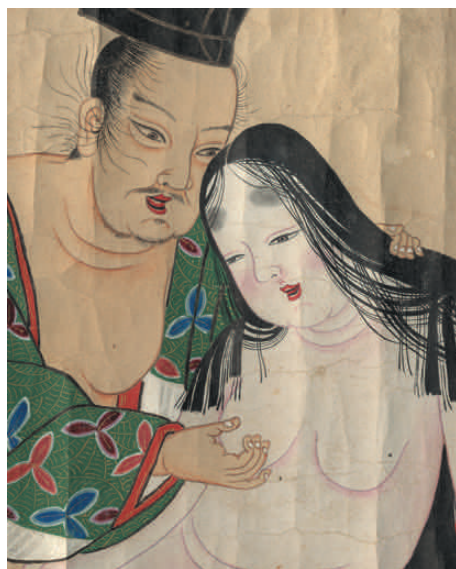
Figure 7. Erotic handscroll by Kanō Motonobu copied during the Edo period by an unknown Kanō artist (detail). Painting on paper. 34.3 x 96.6 cm. Shagan collection, Tokyo.