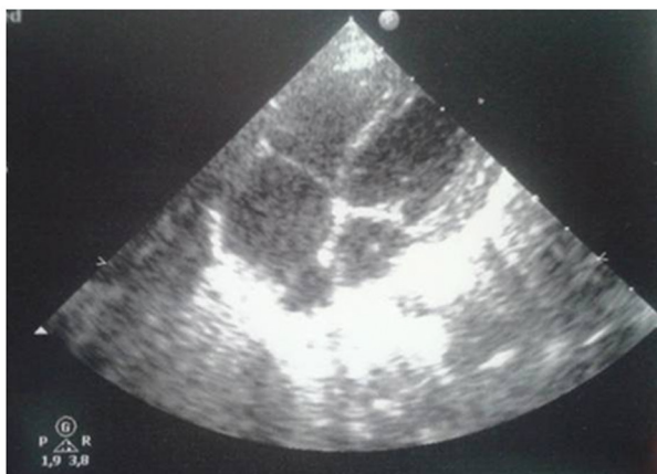
Figure 2 Echocardiogram showing (A) cardiac thrombosis (hyperdense image (30 mm × 4 mm) with tricuspid valve attached to both the atrial and ventricular faces) and (B) resolution after heparin treatment.

When evaluating eculizumab discontinuation we considered the clinical status of the patient and their individual risk benefit profile (including genetic analysis). The topic of eculizumab discontinuation is important yet without consensus. A recent study stated that it is not yet clear whether patients with or without identified genetic mutations are at higher risk of new TMA manifestations when eculizumab is discontinued. 18 However, another suggests eculizumab discontinuation may be safer in patients with no documented complement gene variants after 6–12 months of treatment. 19 Recommendations on treatment discontinuation may become clearer as this is tested in prospective studies and as evidence accumulates in the literature. At current evidence level the decision of length of eculizumab treatment is taken on a case-by-case basis. The decision on treatment strategy should consider the patient's unique clinical situation, age, TMA and family history, as well as recognition of the complex and unpredictable nature of aHUS. If discontinuation of eculizumab is to be considered, the patient must: have been treated for a sufficiently long period to ensure maximal organ function recovery; be monitored closely for signs and/or symptoms of TMA; and have