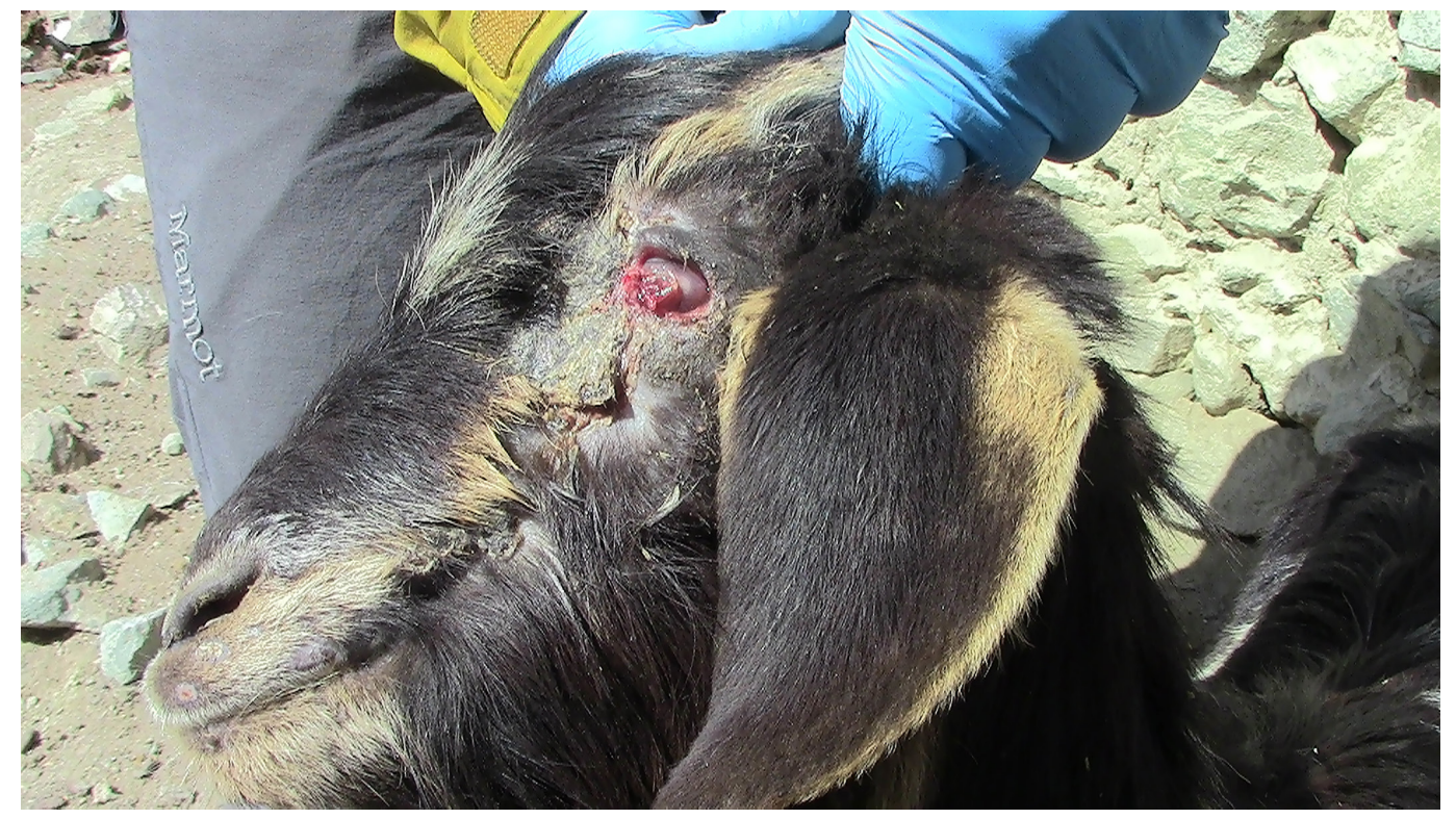
FIG 2: Image of a goat exhibiting a severe stage of infectious keratoconjunctivitis, with bilateral panophthalmitis, lacrymation, hypopyon and perforation of the cornea. Mycoplasma conjunctivae was confirmed in eye swabs by qPCR.

M. conjunctivae and Chlamydiaceae were detected in asymptomatic and clinically affected eyes of sheep and goats from the CKNP, Gilgit-Baltistan district of Pakistan. These results agree with the previously reported sporadic IKC cases in sheep flocks with endemic M. conjunctivae infections and its capability to establish asymptomatic ocular infections.<sup>837</sup> Reports of non-epidemic IKC in goats are scarce<sup>38</sup> and most of the IKC descriptions refer to outbreaks.<sup>3940</sup> However, the results obtained in this study suggest that M conjunctivae is endemic in mixed sheep–goat flocks of the CKNP area. Although M conjunctivae