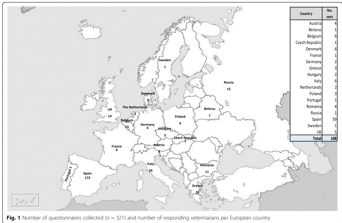
Fig. 1 Number of questionnaires collected (n = 321) and number of responding veterinarians per European country