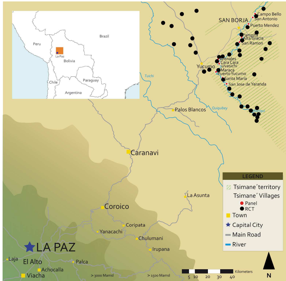
Figure 1. Map showing location of [1] 13 Tsimane' villages of the nine-year (2002-2010) annual panel study along the Maniqui River and [2] 40 additional Tsimane' villages of the randomized controlled trial (RCT), both in the department of Beni, Bolivia

Notes: The shading of the territory denotes elevation (Mamsl = meters above sea level). The square symbols and letters in each town are approximately proportional in size to the population of the town. The Tsimane' territory is an administrative division and does not capture all the lands inhabited by the Tsimane'.