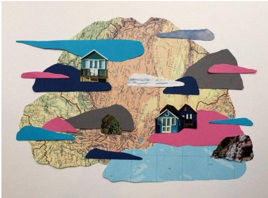
Figure 3: an example of Louise's collages

In this way the creation of imagery of 'place' aligns with Jaworski and Thurlow's (2010, p. 9) description of place as collective memory: