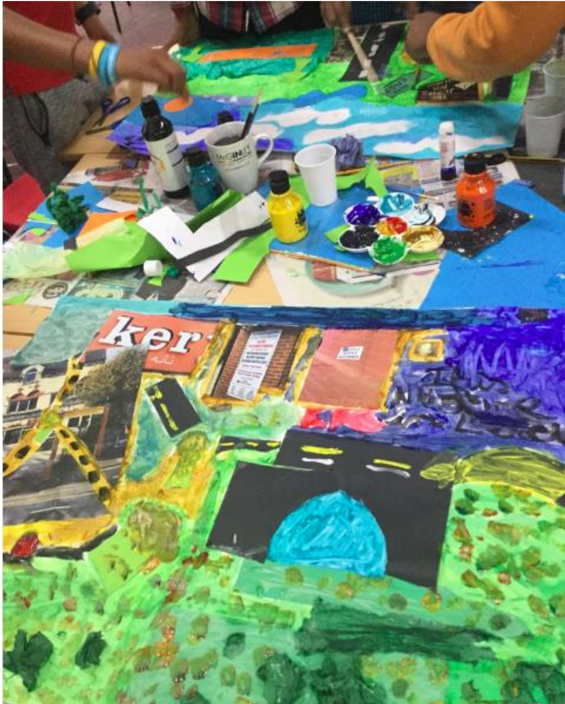
Figure 5: collage in progress

another layer of colour into their work. As well as a practical measure, this also allowed them to develop themes from the text and imagery before deciding how the colour might affect their collages.