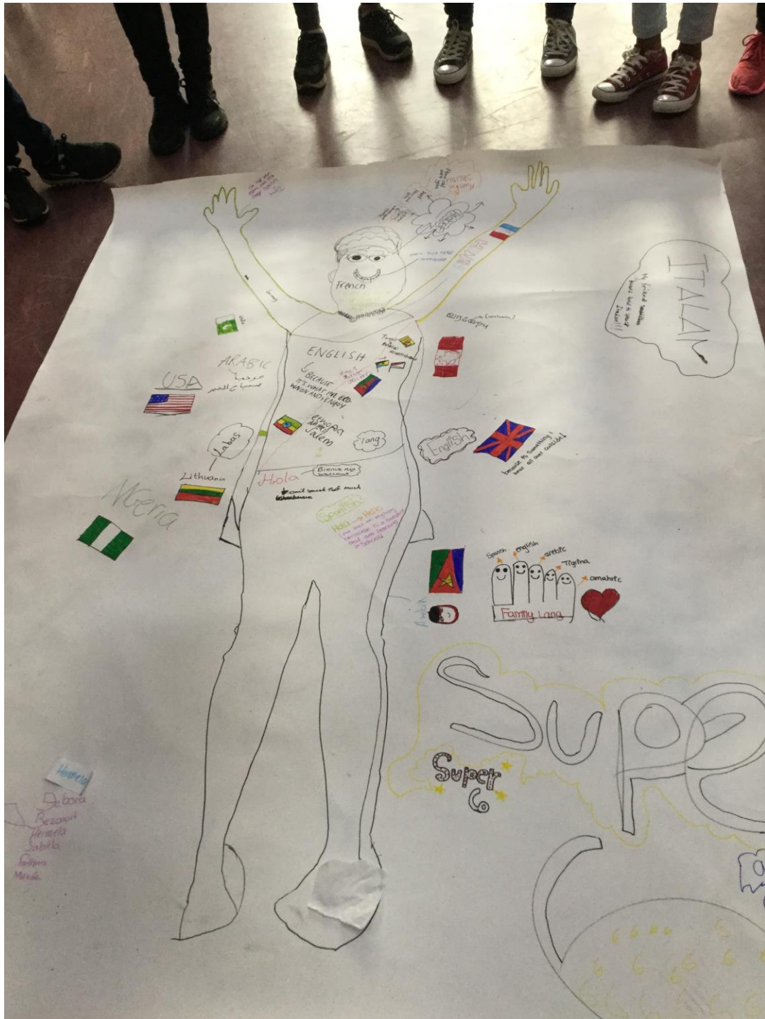
Figure two: group language portraits

We then conduct ethnographic explorations of the street and surrounding area in small groups using photography, video and interviewing of community members (e.g. shopkeepers), to develop understandings of the local semiotic landscapes and the meanings behind signs. This is based on the TLANG linguistic landscape research