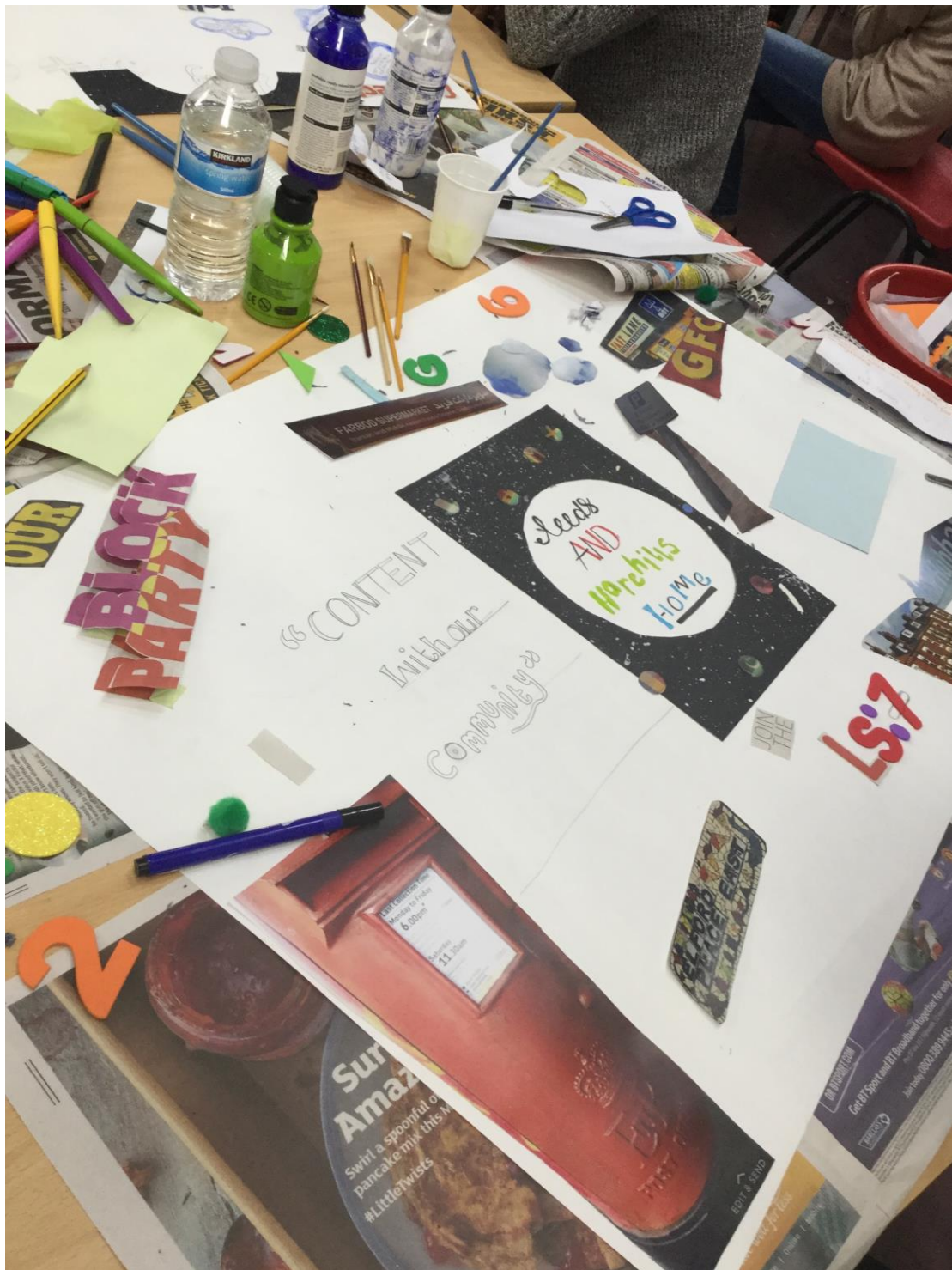
Figure 4: collage in progress

As a way of introducing colour to their work, participants applied cut out shapes from coloured paper and tissue paper which they also screwed up and glued to the surface to recreate the greenery of the park which they had seen and worked in earlier in the programme. Halfway through the session the groups were given paints to introduce