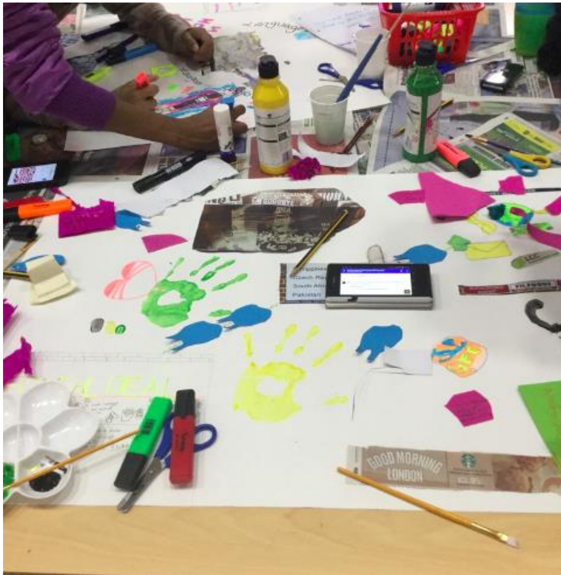
Figure 6: collage in progress

Conversely, the girls' works appeared more analytical, incorporating more handwritten text and quotes that they had heard and produced throughout the ethnographic linguistic landscape research period. These works also contained elements of the multilingualism within the neighbourhood as well as references to their personal interests, such as fashion.