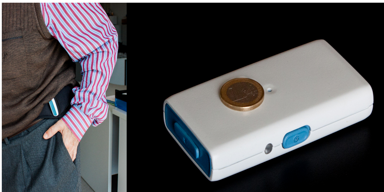
Figure 1. Inertial sensor.