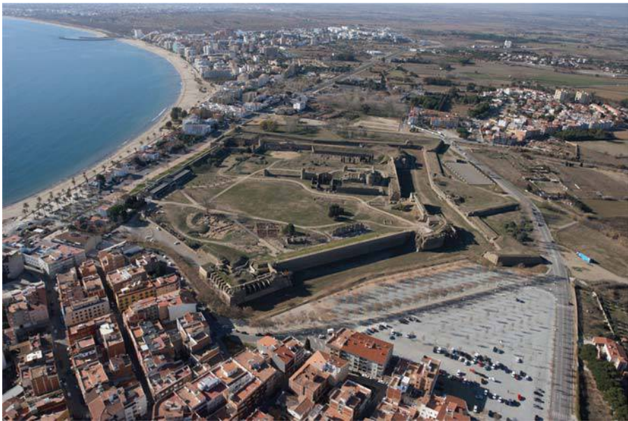
Plate 1. The Citadel in the middle of the town of Roses (2008)