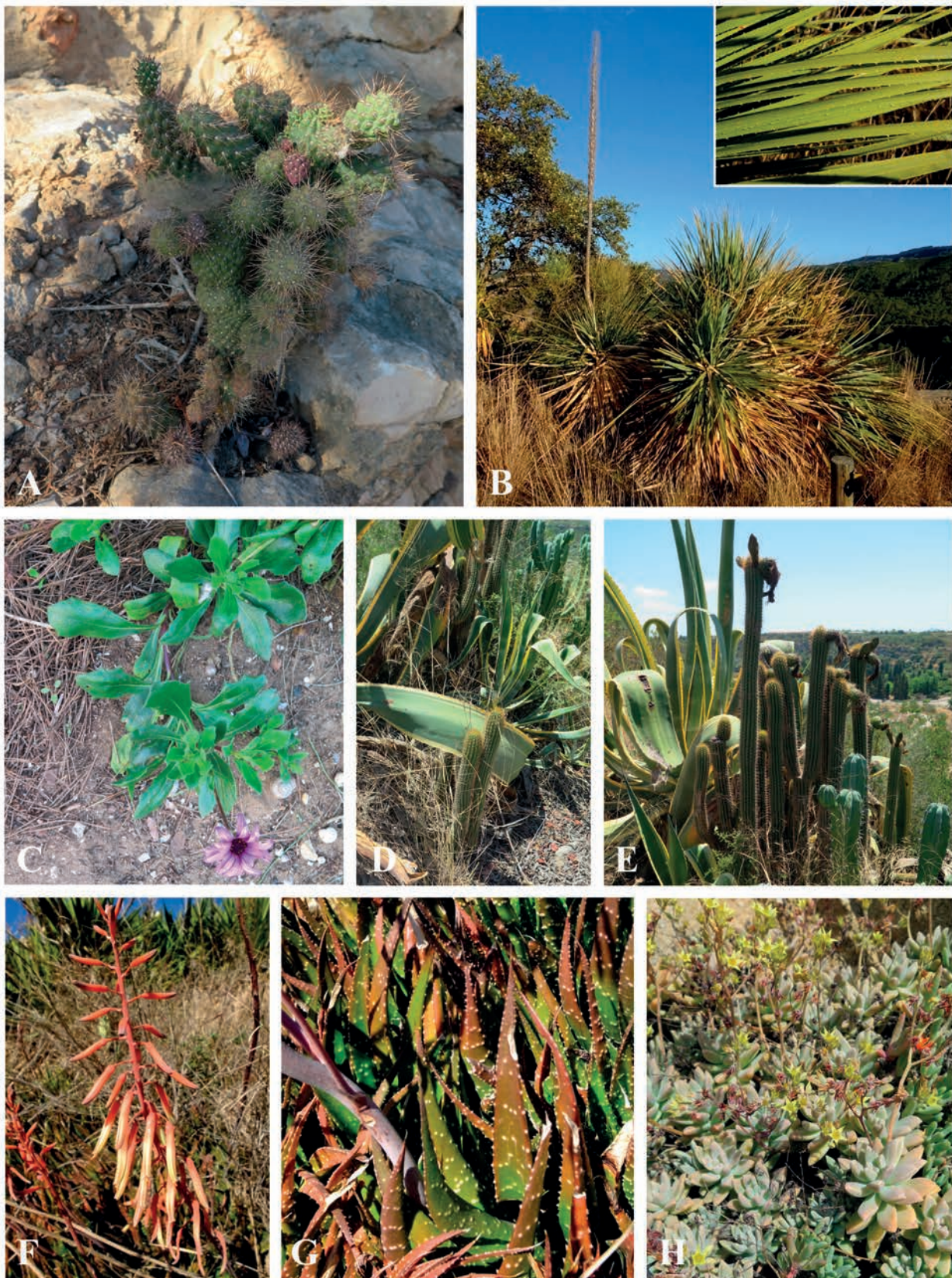
Figure 2. (A), Cylindropuntia fulgida , Alcanar; (B), Dasylium serratifolium , Darnius; (C), Dimorphotheca fruticosa , l'Es-cala; (D, E), Echinopsis spachiana , Roquetes; (F, G), Gasteraloe beguinii , Bellvei; (H), Graptosedum , Palamós (photographs A, C–E, H: C. Gómez-Bellver; B, F, G: J. López-Pujol).