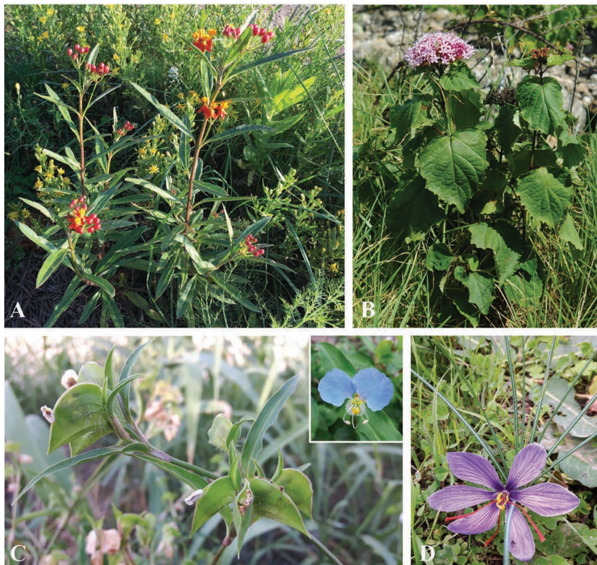
Figure 1. (A), Asclepias curassavica, Santa Coloma de Cervelló; (B), Clerodendrum bungei, Tortosa; (C), Commelina erecta, Vilassar de Mar; (D), Crocus sativus, Sant Feliu del Llobregat.

provinces. The species had not been recorded for the last 33 years so far, probably because the populations of this archaeophyte have been declining for decades due to the cessation of its production.