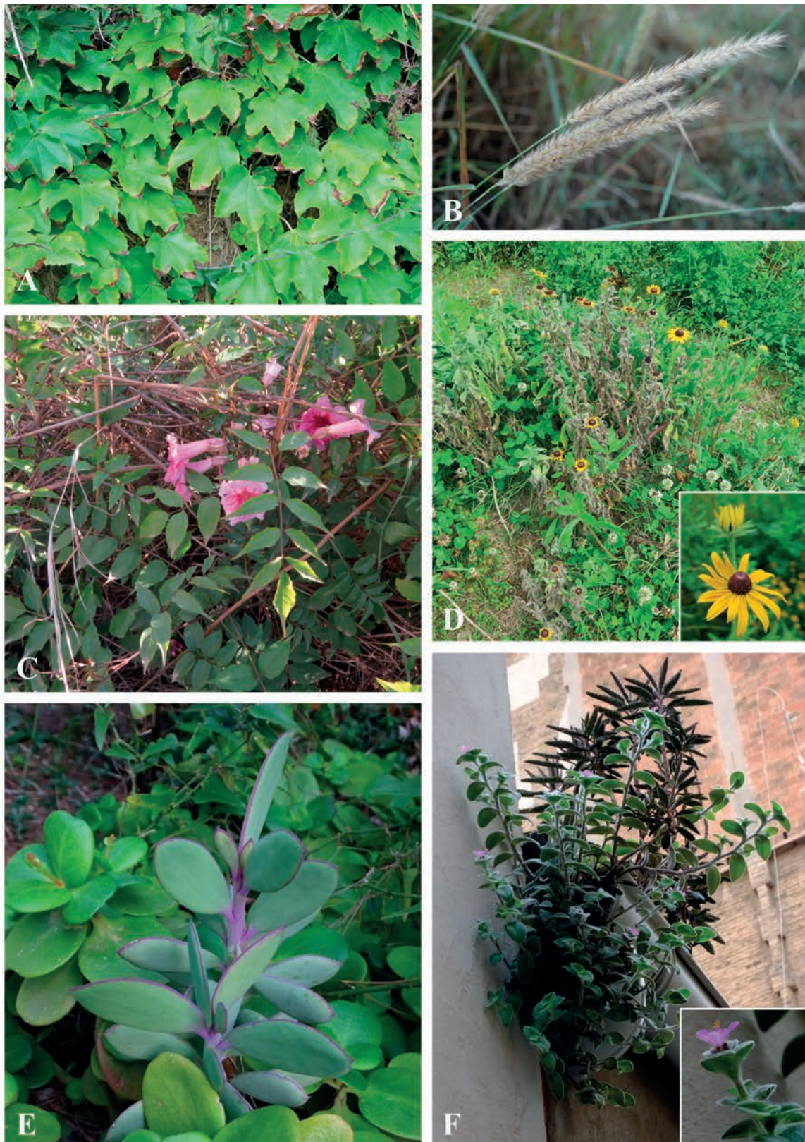
Figure 4. (A), Parthenocissus tricuspidata , Palafrugell; (B), Pennisetum flaccidum , el Papiol; (C), Podranea ricasoliana , Esplugues de Llobregat; (D), Rudbeckia hirta , Barcelona; (E), Senecio crassissimus , Tarragona; (F), Tradescantia sillamontana , Barcelona (photographs A, C, D: C. Gómez-Bellver; B: H. Álvarez; E, F: J. López-Pujol).