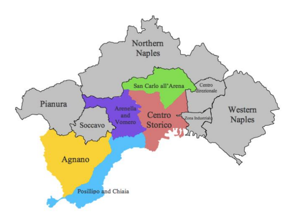
FIGURE 1: Chiaiano in the Neapolitan area