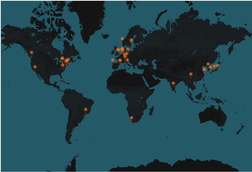
FIGURE 1 World map showing the 34 institutes participating in the ENIGMA-OCD consortium

cross-sectional structural MRI data a mega-analysis performs better than a meta-analysis (lower standard errors and narrower confidence intervals), and in a multi-center study with moderate variation between cohorts, a linear mixed-effects random-intercept mega-analytical framework seems to lead to the best model fit (Boedhoe et al., 2019).