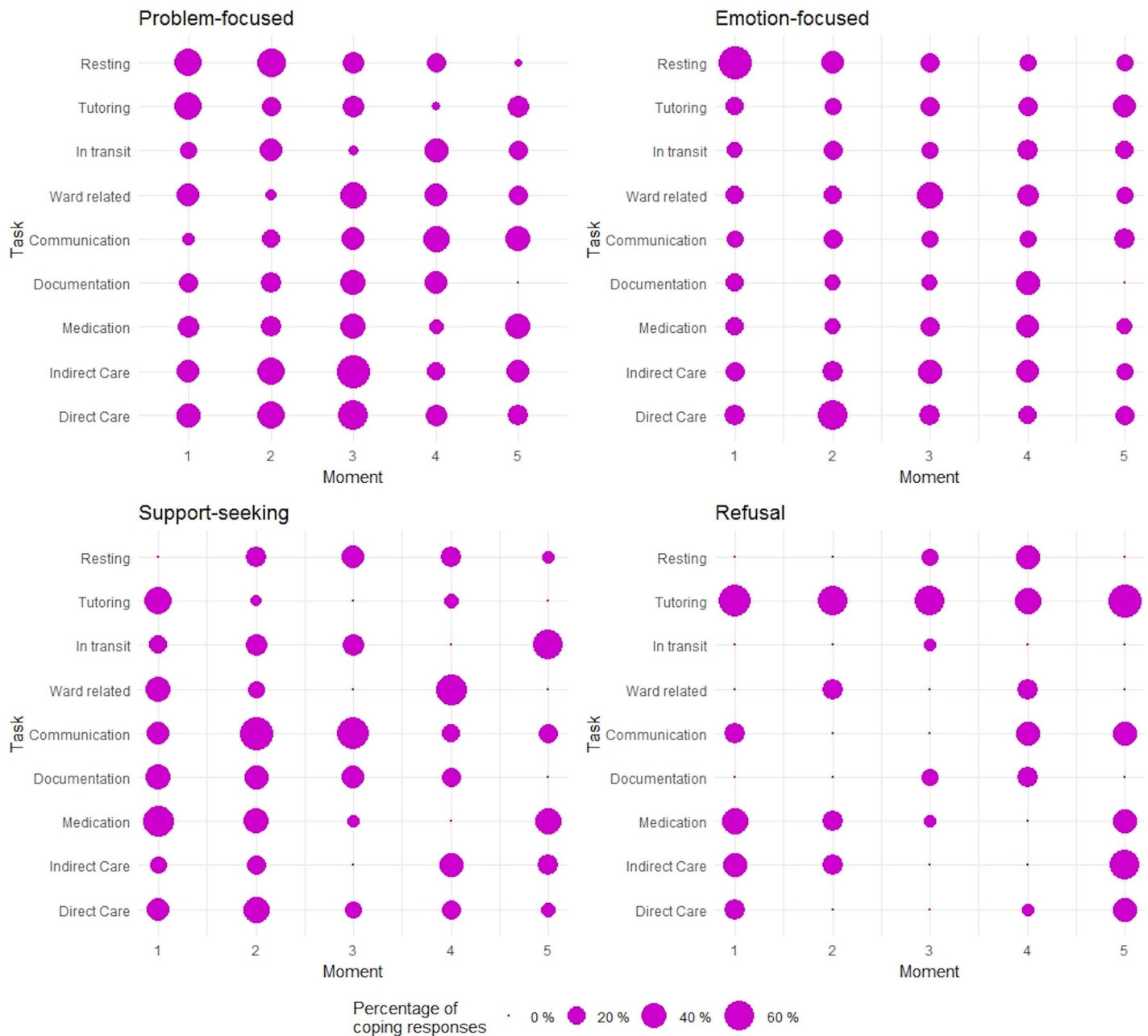
Fig 2. Frequencies of the different types of coping strategies depending on the task performed and the time point during the shift.

https://doi.org/10.1371/journal.pone.0240725.g002