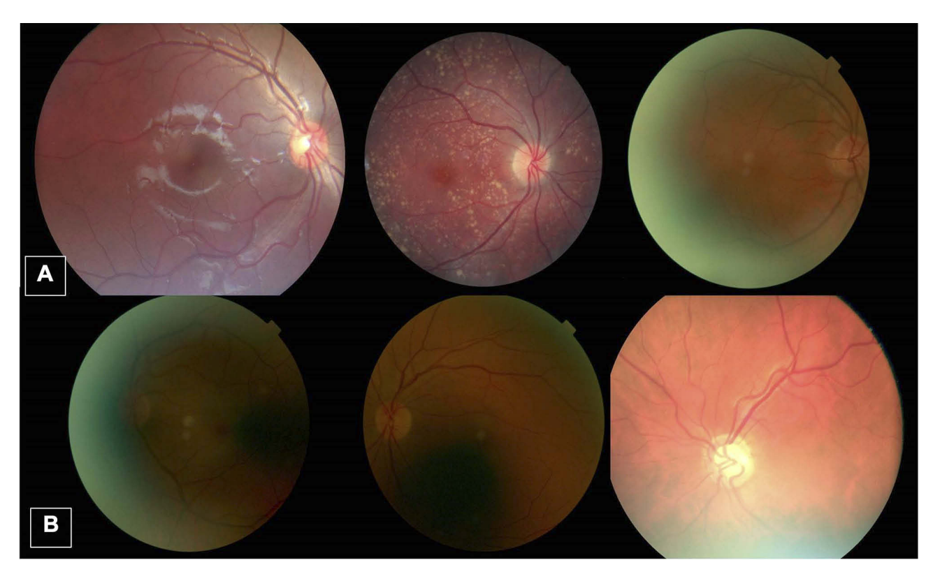
Figure 2 (A) Examples of good quality images. Retinal fundus images are centered on the macula with correct focus, good visualization of the parafoveal vessels and over two disc diameters around the fovea, and correct observation of the optic disc (at least three-quarters) and the vascular arcades. (B) Examples of poor quality images.

disc (at least three-quarters), and the vascular arcades. Figure 2 shows an example of good and bad quality retinal fundus images. We also trained the same CNN-1 from scratch for a different objective with geometric data augmentation.