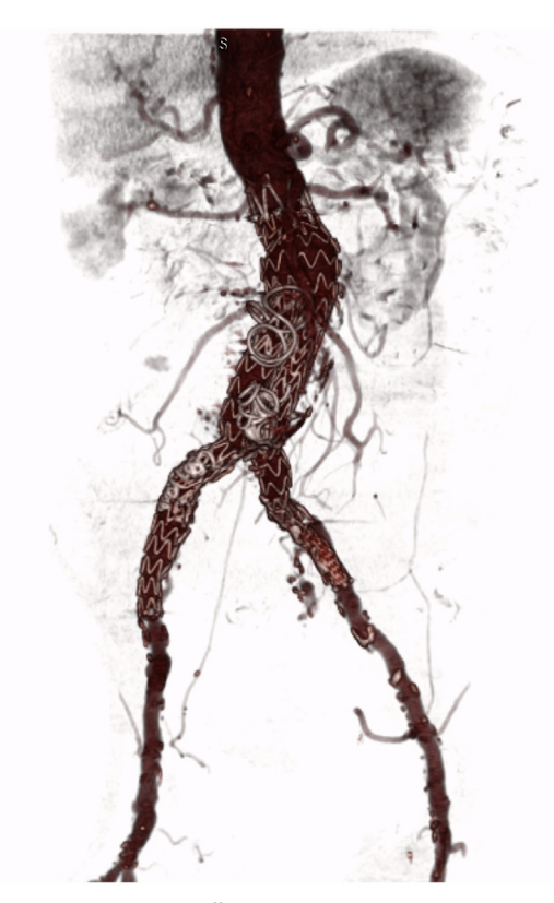
Fig. 3. Surveillance contrast CT scan.

However, it demands careful consideration of the status of the aortic lumen, which cannot be determined by CO<sub>2</sub> angiography and simple CT alone. Also, IVUS can be employed, during aneurysmal aorta procedures, not only to properly size the aortic stent graft but also to reduce the amount of medium contrast and radiation exposure.<sup>13</sup> Regrettably, these tools are not available at the study centre.