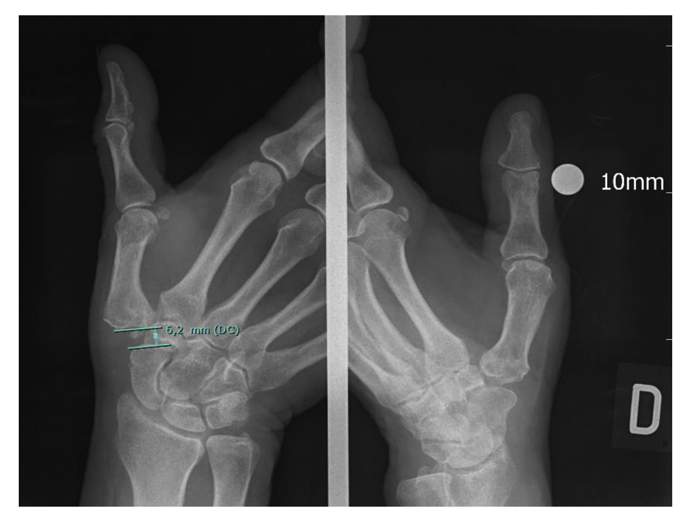
Figure 3. Lateral x-ray view of the thumb metacarpal used to measure trapezial height, measured as the distance in millimeters between 2 parallel lines marked by the articular surface of the distal pole of the scaphoid and the thumb metacarpal base.

space height was measured using calibrated x-rays. It was measured as the distance in millimeters between 2 parallel lines marked by the articular surface of the distal pole of the scaphoid and thumb metacarpal base in the lateral x-ray view. Two radiologists who were blinded to the functional outcome but not to the method of treatment performed all radiographic measurements (Fig. 3).