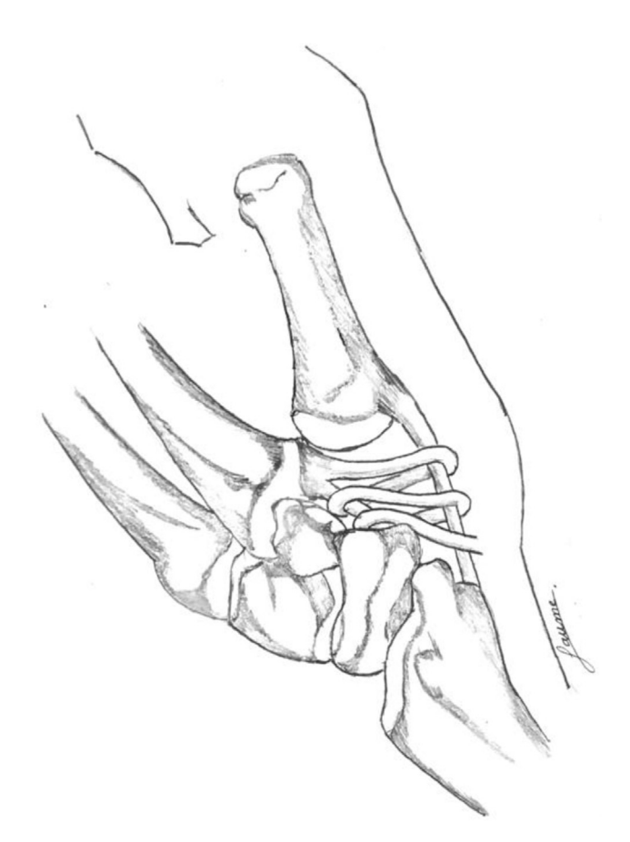
Figure 2. Harvested half of the flexor carpi radialis tendon woven in a figure-of-8 form around the insertion of the abductor pollicis longus tendon and a remaining strand of flexor carpi radialis.

Objective outcomes included trapezial space height, key pinch strength, grip strength, and joint range of motion. Subjective outcomes were function and pain.