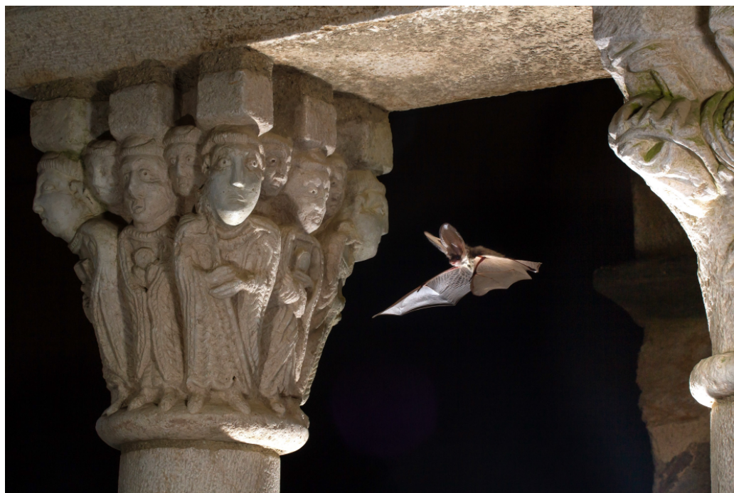
Figure 4. Great long-eared bat Plecotus austriacus returning to his/her roost in the Sant Pere de Rodes monastery. This ninth century building is home to the largest known colony of this species in Catalonia, Spain.