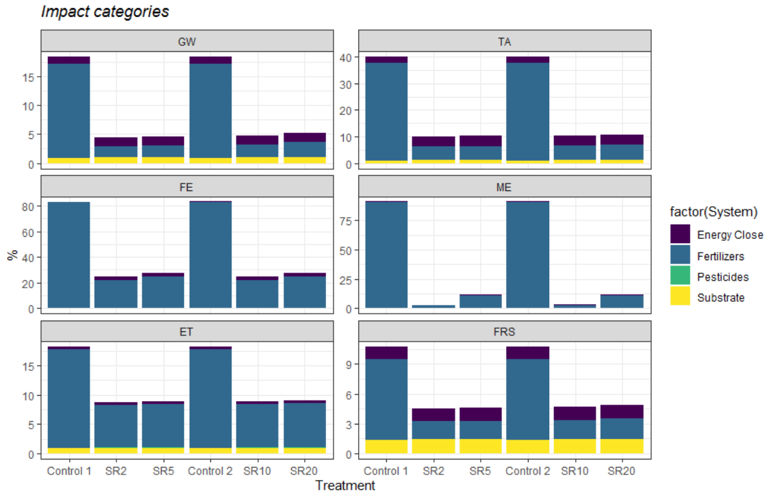
Figure 3: Environmental performance of the operation System in % per IC.