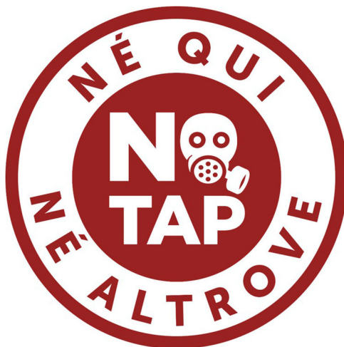
Figure 10. Against the TAP in Puglia.

Italian best-known “No” movements are currently No Tav, No Tap, No Muos, No Ponte, No Grandi Navi, No Triv, Mamme No Inceneritore, all born at particular locations but with wide reach. They are respectively on the very material issues of the new rapid railway line between Turin and Lyon, the gas pipeline in Puglia, the Mobile User Objective System (a military satellite communications system promoted by the U.S. government in Niscemi, Sicily), the bridge over Messina Strait, the nuisance from the enormous cruise ships in Venice waters (at least until 2020), the off shore oil drilling, the waste incineration (Bertucci 2019). Some of them are directly related to fossil fuels and therefore climate change, others only indirectly.