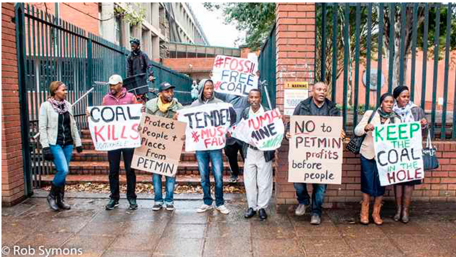
Figure 6. Keep the coal in the hole (Nov. 5, 2020).

Russia is a country where coal extraction is increasing. The sixth larger producer after China, the U.S.A., India, Australia and Indonesia although the U.S.A. is decreasing coal production. The Kuzbass is one of the growing areas for coal extraction. Russia seems determined to extract its fossil resources for profit, regardless of the consequences for local and global ecology or for the local population