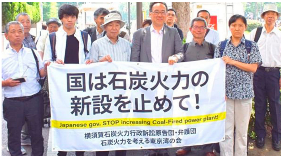
Figure 4. https://beyond-coal.jp/local-activities/yokosuka/ . https://ejatlas.org/conflict/yokosuka-coal-power-plant

One could multiply the grassroots instances of opposition to coal (Temper et al. 2020; Roy 2021). Of the many instances in India, I shall show a success in Karnataka in 2008 where climate change was not yet mentioned. The Government decided to implement three CFPP projects of 1000 MW each in Gulbarga, Belgaum and Chamalapura. In August 2007, the Power Company of Karnataka Ltd (PCKL) issued a Global Invitation for Request for Qualification (RFQ), inviting bids for setting up a 1000 MW