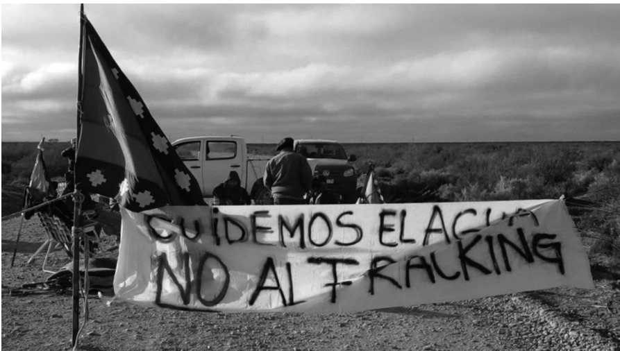
Figure 7. Against Chevron's fracking in Neuquén, Argentina.

To stop pipelines is often an objective of local environmental movements reinforced by global concerns about climate change. The word “Blockadia” was born in these encounters in North America (the U.S.A. and Canada), often involving indigenous population (Temper 2019). Thus Sioux complained against the Dakota Access Pipeline (DAPL), U.S.A., arguing that “water is sacred” and therefore economic compensation is not the issue. The DAPL, with the Standing Rock famous