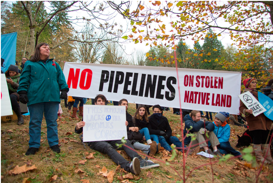
Figure 9. https://ejatlas.org/conflict/mencherep-residents-succesfully-resisting-a-new-open-coal-pit-threatening-their-village

called the Southern Gas Corridor carrying gas to Europe which includes the Trans Anatolian Pipeline (TANAP) and the Trans Caspian Gas Pipeline.