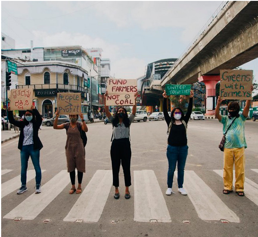
Figure 1. Fridays for Future in India. Source: https://www.thenewsminute.com/article/fridays-future-was-govt-radar-long-disha-ravis-arrest-inside-view-143502