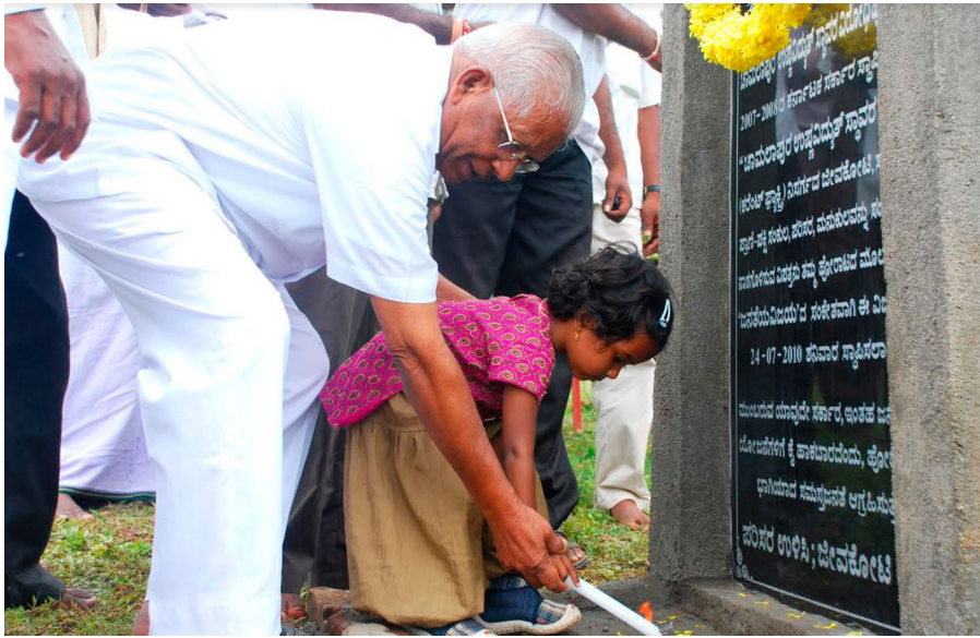
Figure 5. Chamalapura, Mysore district.