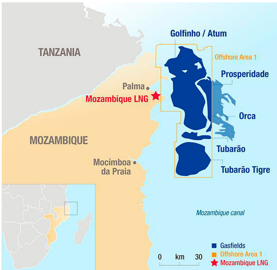
Figure 11. The LNG extraction plans at Cabo Delgado.