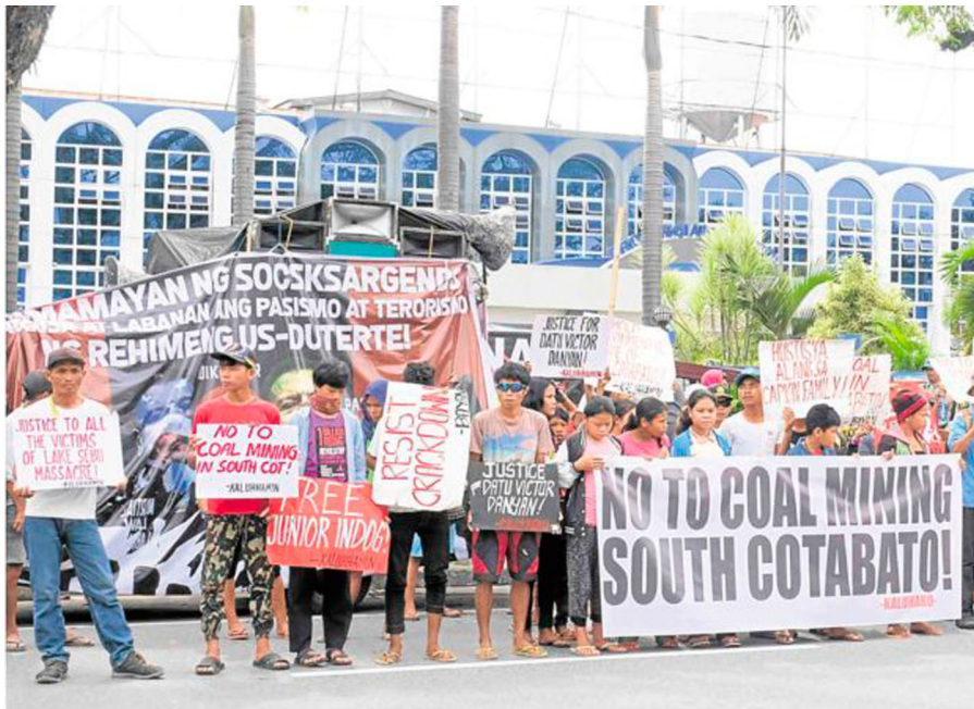
Figure 2. Against coalmining in South Cotabato, Philippines. Source: Bong S. Samiento. https://ejatlas.org/conflict/coal-mining-in-barangay-ned-south-cotabato-philippines .

oppose open cast coal mining and condemn the killing of tribal leaders in the province. Two thousand hectares for mining were going to be used by the San Miguel Corporation to take out about 27 million tons of coal, a clear case of “commodity widening” (expanding territorial control). The project was stopped (Delina 2021).