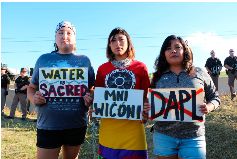
Figure 8. The DAPL.

In Puglia they have fought to protect land and community from the Trans Adriatic Pipeline (TAP). They want to stop the circulation of gas. This pipeline and terminal threatens ancient olive farms, water sources, cultural heritage sites and a stunning coastline. It is part of the larger project