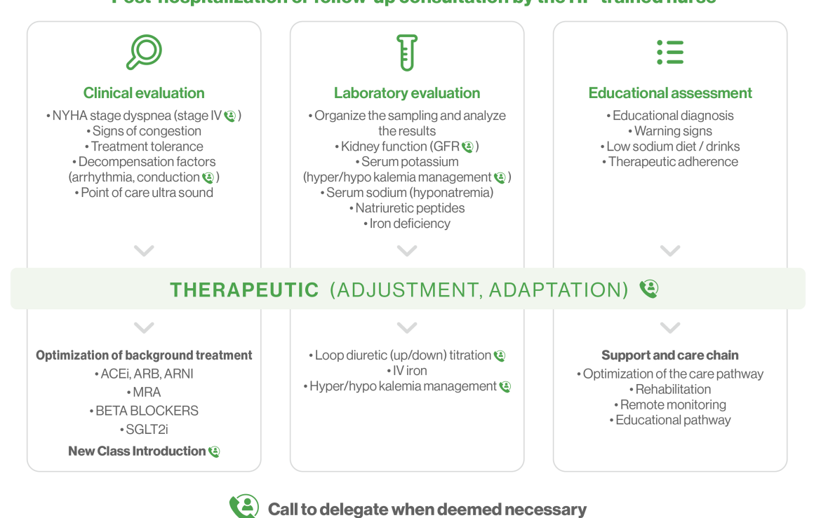
Figure 2 Tasks that could be delegated to HF-trained nurses.

DMP, usually providing care outside of hospitals, have been shown to reduce the risk of both all-cause mortality and HF-related hospital readmission by approximately 30%<sup>36</sup> and are now formally recommended in 2021 ESC guidelines on HF. The implementation of these DMPs now often relies on telemonitoring (and e-tools) and telemedicine solutions<sup>37</sup> (including remote monitoring of pulmonary artery pressure). These e-Health approaches are even more cardinal following the advent of the COVID-19 pandemic (which highlighted the limitations of our healthcare organizations in HFrEF). Telemedicine has the major advantage of being relatively unaffected by lockdowns or periods of quarantine, decreases risks of infection, and, therefore, ensures continuity of care even during a pandemic.<sup>38</sup>