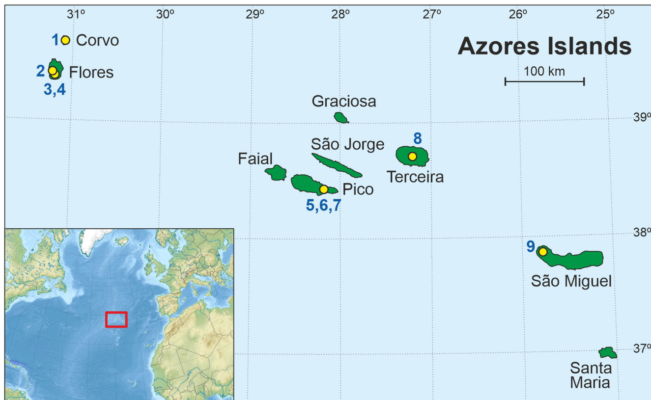
FIGURE 1 Map of the Azores Islands indicating the sites with palaeoecological records discussed in the text (yellow dots). 1, Caldeirão; 2, Alagoinha; 3, Rasa; 4, Fundá; 5, Caveiro; 6, Peixinho; 7, Pico; 8, Ginjal; and 9, Azul. Coring localities after Connor et al. (2012, 2013); Rull, Lara, et al. (2017) and Raposeiro et al. (2021).

to a holistic view of the Azorean archipelago (Figure 1). This said, some aspects of the Raposeiro et al. (2021) reconstruction not raised by Elias et al. (2022) will be analysed here in more detail, with the only aim of contributing to identifying potential issues to be addressed by future studies, as suggested by Raposeiro et al. (2022).