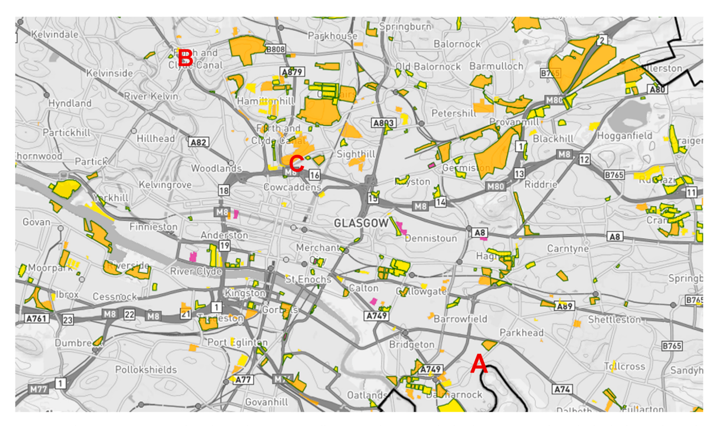
Fig. 3. Scottish Government Vacant and Derelict Land Survey Map. Yellow areas indicate vacant land and orange areas indicate derelict land. 'A' indicates the Commonwealth games site, including the Athlete's Village and 'B' to 'C' indicates the Forth and Clyde Canal regeneration project from Maryhill to Port Dundas.