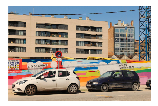
Fig. 4. Construction works next to Cristóbal de Moura Street with grafitis that read "no offices" and "we want green spaces" (Source: Authors, 2021).

In Amsterdam Noord, civic interviewees also described how neighbors have become scared and threatened by urban renewal and new developments in general, as they are linked to gentrification and the lack of affordable housing availability. A Noord resident and activist (2019) described as follows: "in these houses everybody feels that [...] they know that the end has come for them, so they see the future coming [...] and everybody realizes it will have consequencesm [...] so everyone is getting really afraid of new development".