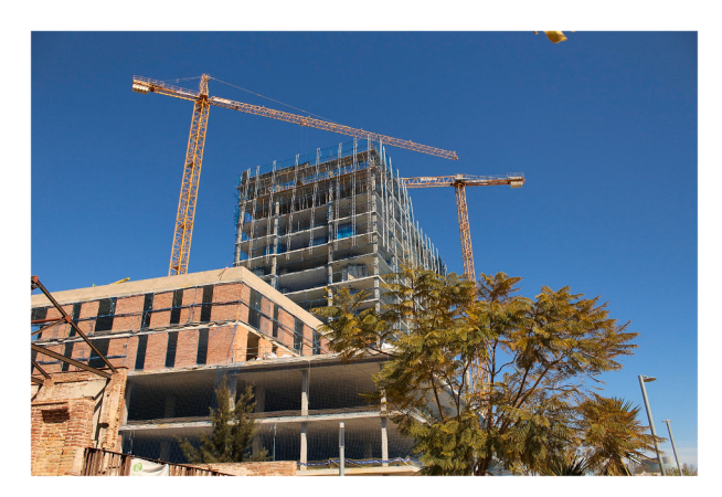
Fig. 6. The Student Hotel under construction next to the green corridor on Cristóbal de Moura.

the traffic-pacified and green Poblenou Superblock. Respondents report a similar social impact for some of the new climate-adaptive green projects inaugurated in 2020, namely the green corridor in Cristóbal de Moura. Some interviewees also believe that current residents will be replaced by higher-income groups —workers in the new offices or international students that will reside in the new Student Hotel currently under construction (see Fig. 6)— and they will be the future beneficiaries of this investment in greening rather than longtime residents. A member of a housing association in Poblenou (2021) said: "there is no question that the area around Cristóbal de Moura is nicer than before, but the question is: why is it nicer, and most importantly, for whom?"