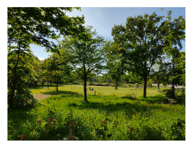
Fig. 3. Noorderpark in Amsterdam Noord (Source: Authors, 2019).