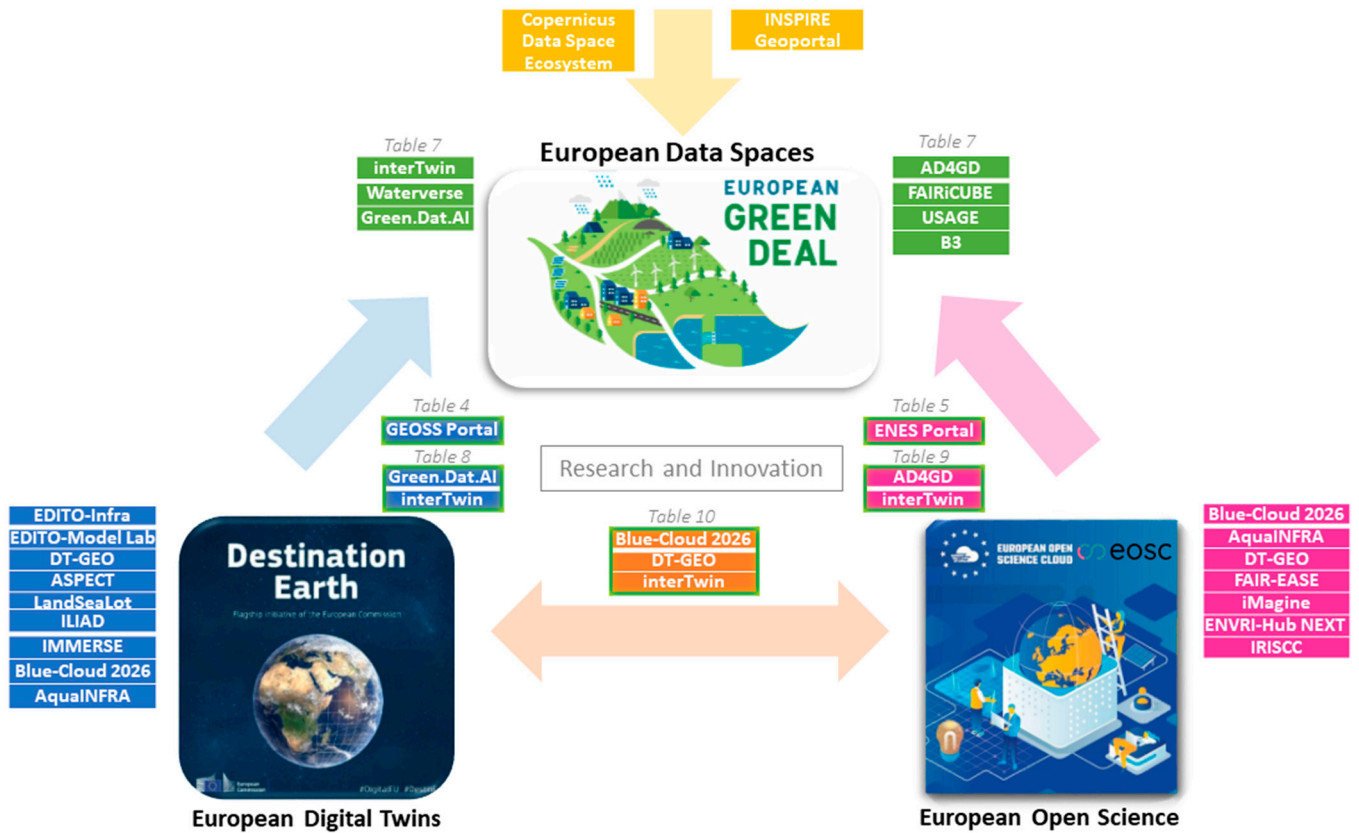
Figure 3. Stakeholder mapping of collaboration opportunities among the projects and initiatives relevant to the GDDS, DTs of the Earth, and the EOSC.

through ENES Portal, AD4GD, and interTwin. Lastly, the relationship between DTs of the Earth and the EOSC is highlighted in orange boxes, represented by Blue-Cloud 2026, DT-GEO, and interTwin.