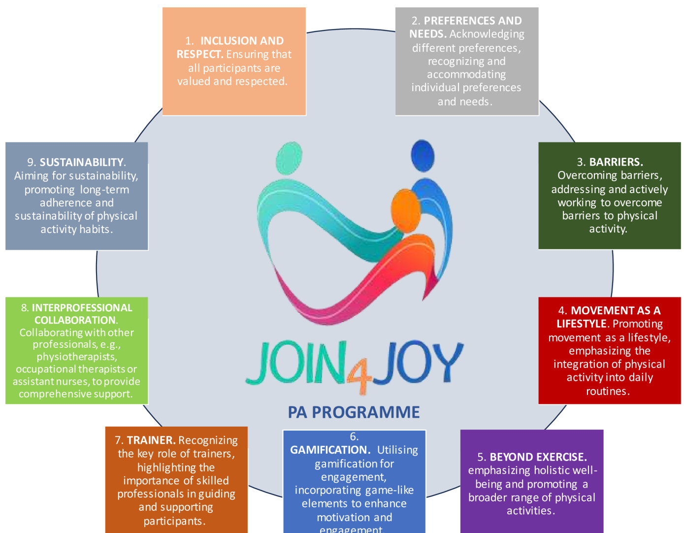
Figure 2 The nine core principles of the Join4Joy PA programme emerging from the co-creation phase.

These core principles serve as a foundation for the Join4Joy PA framework, ensuring that it is inclusive, tailored to individual needs, and focused on sustained engagement and well-being. Alongside, recommendations for potential activities and good practices were identified to be conducted to personalise the programme to the needs and preferences of the end users. Accordingly, the developed programme also includes a comprehensive list of different activities that trainers can choose from, implement and adapt as needed in their respective settings. These activities are designed to be flexible and person-centred, so that they can be customised to meet