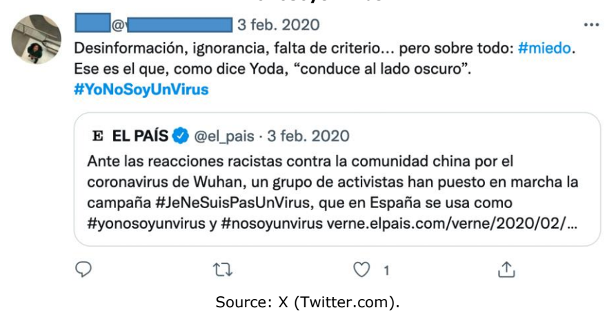
Image 8. Example of a X (former Twitter) post with the hashtag #YoNoSoyUnVirus

In turn, in the case of campaign posts written in Spanish and observed from Spain, even without the goal of a statistic representation, we identified, through social media monitoring, two movements that seem to stand out. On one hand, the reinforced use of the hashtag #YoNoSoyUnVirus with small personal commentary of people supporting the cause and the reinforcement of journalistic content about the campaign (Image 8). On the other hand, many digital micro influencers —users with up to 10 thousand followers (Primo et al., 2021)— with Asian origins appeared with similar posts supporting the campaign, with images holding a poster with the hashtag «YoNoSoyUnVirus», among which we highlight the profile of the Spanish lawyer and intercultural mediator of Chinese descent Antonio Liu (Image 9).