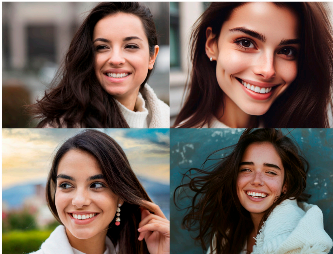
Figure 1. Examples of human portrait stimuli obtained with the same prompt (see Appendix A—Human portrait 1). The top left image was sourced from Freepik (non-AI), the top right was generated using DALL·E 3 (via Bing), the bottom left with Firefly, and the bottom right with Midjourney.

This dual-generation method was selected because it reflects how individuals—whether visually trained or not—typically obtain visual content. When not using AI, a person might either take a photo themselves (with a smartphone or camera) or search for a suitable image using a platform like Freepik. In both cases, the image search is driven by a specific personal or professional need. In this study, the researchers acted as the content-seeking user, establishing the image selection criteria. For the AI-generated images, the same descriptive text used in the stock image database search was applied as a prompt, with the goal of producing a comparable visual output: a single image. The texts used are available in Appendix A (note that Spanish was the language used, but English translations are also reported). All the images were obtained and generated in March 2024.