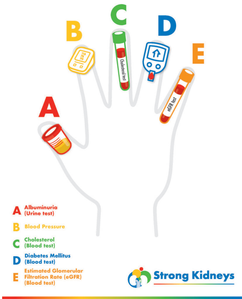
Figure 4: Infographic for the Strong Kidneys ABCDE campaign.

Individuals at risk of CKD (Box 3) and with CKD should have their lipid profile (total cholesterol, low-density lipoprotein cholesterol, high-density lipoprotein cholesterol and triglycerides) checked [91, 92]. In general, individuals with moderate to severe CKD (Fig. 1, Table 2) are considered to be at high or very high risk for CVD and should be treated with a statin or statin/ezetimibe combination [32, 91, 92]. Risk in other individuals should be assessed with risk equations, preferably those including GFR and albuminuria [37–42], and treated accordingly.