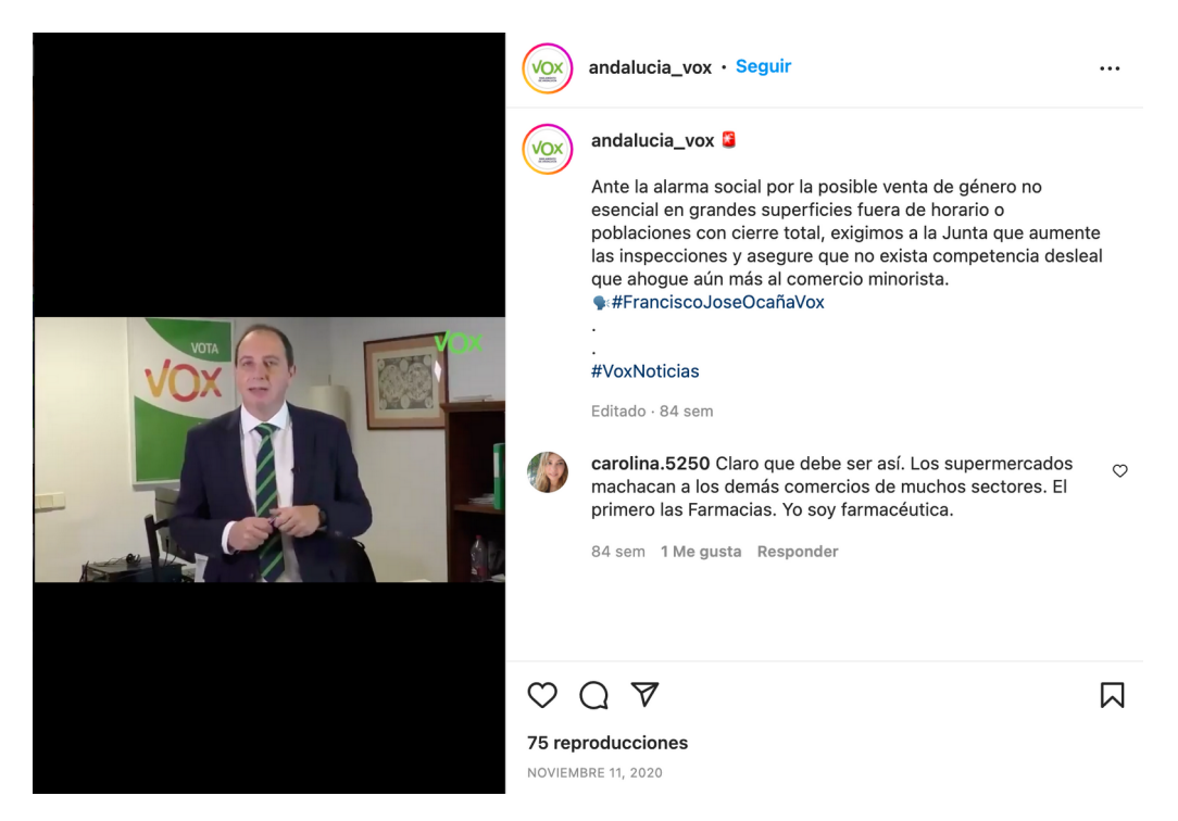
Figure 3. (VOX Parlamento de Andalucía, 2020)

A (32%); proportionally, no other party has devoted so many publications to a specific topic. Moreover, this theme is addressed most often by all of the parties, except for three: Anticapitalistas-A, PP-A, and PSOE-A. In the first, gender/feminism stands out; in the second, the "campaign and/or political parties" topic; in the third, "health and social welfare".