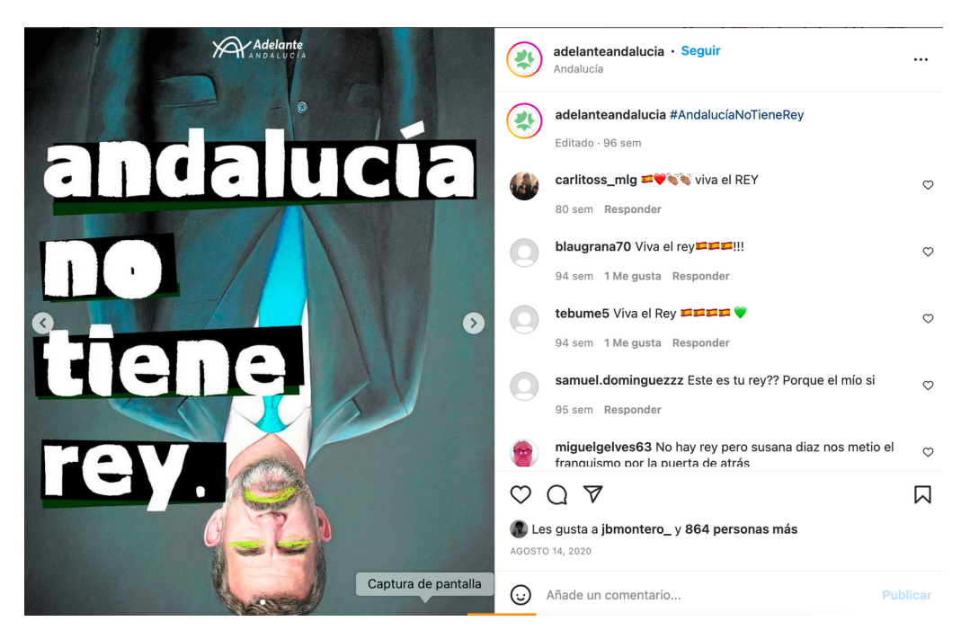
Figure 4. (Adelante Andalucía, 2020)