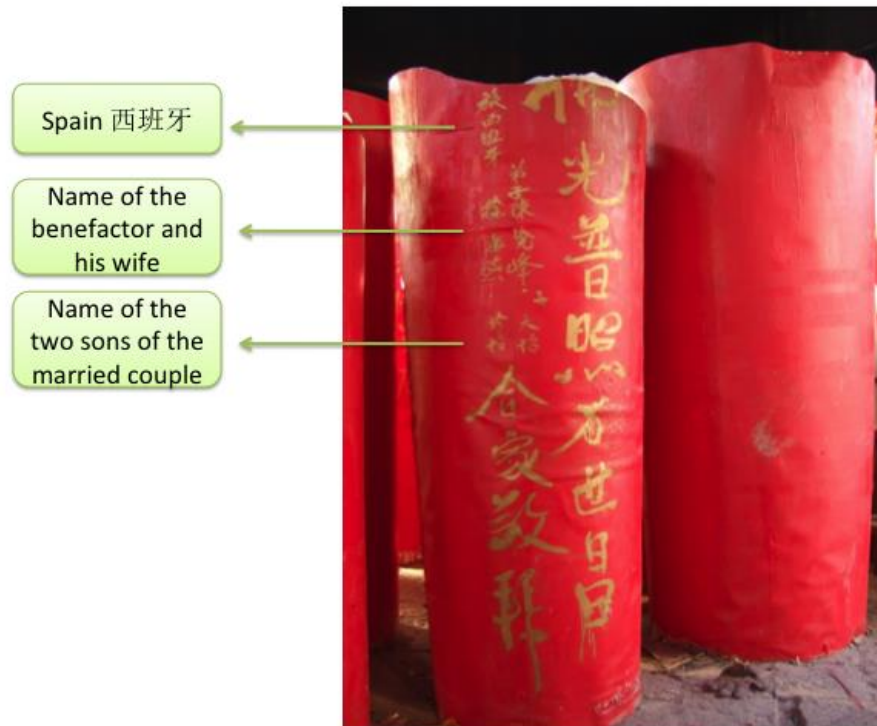
Fig. 12.2 Candle Representing a Transnational Nuclear Family at Qingzhenchan Temple, Fushan.

Masdeu Torruella, I. , 2014, After Migration and Religious Affiliation: Religions, Chinese Identities and Transnational Networks . Chee-Beng, T. (ed.). Singapur: World Scientific , pàg. 329-349