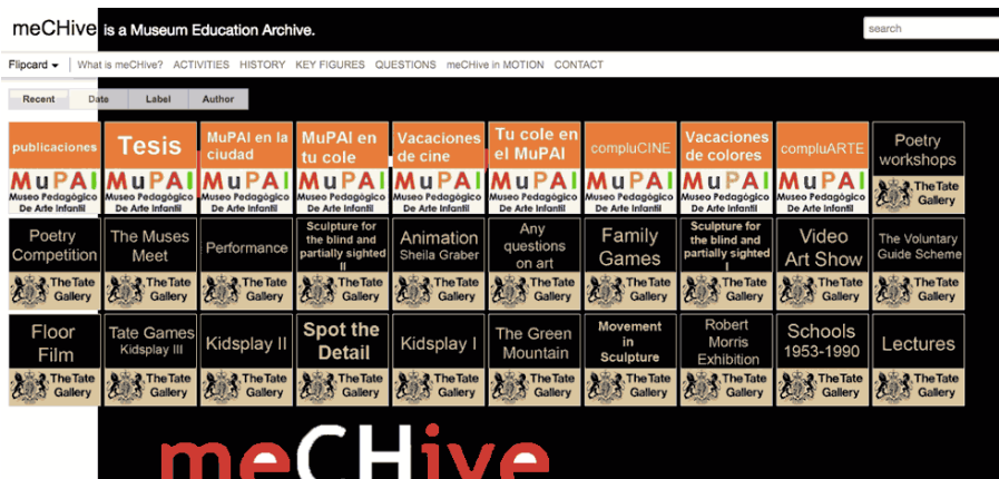
Figure 3. The Museum Education Archive (meCHive) screenshot

We considered the copyright issues attached to broadcasting certain materials belonging to the Tate Archive on an online platform. Once all copyright issues were cleared up, we started creating the activity capsules that include radio broadcastings, interviews, photographs of the activities, recordings of the program audiences and paper clippings. We selected 21 activities to be displayed in the ACTIVITIES section of the museum education online archive ( http://mechive.blogspot.co.uk ) created within the framework of this project (Figure 3). All information is in both English and Spanish, and videos are subtitled in Spanish.