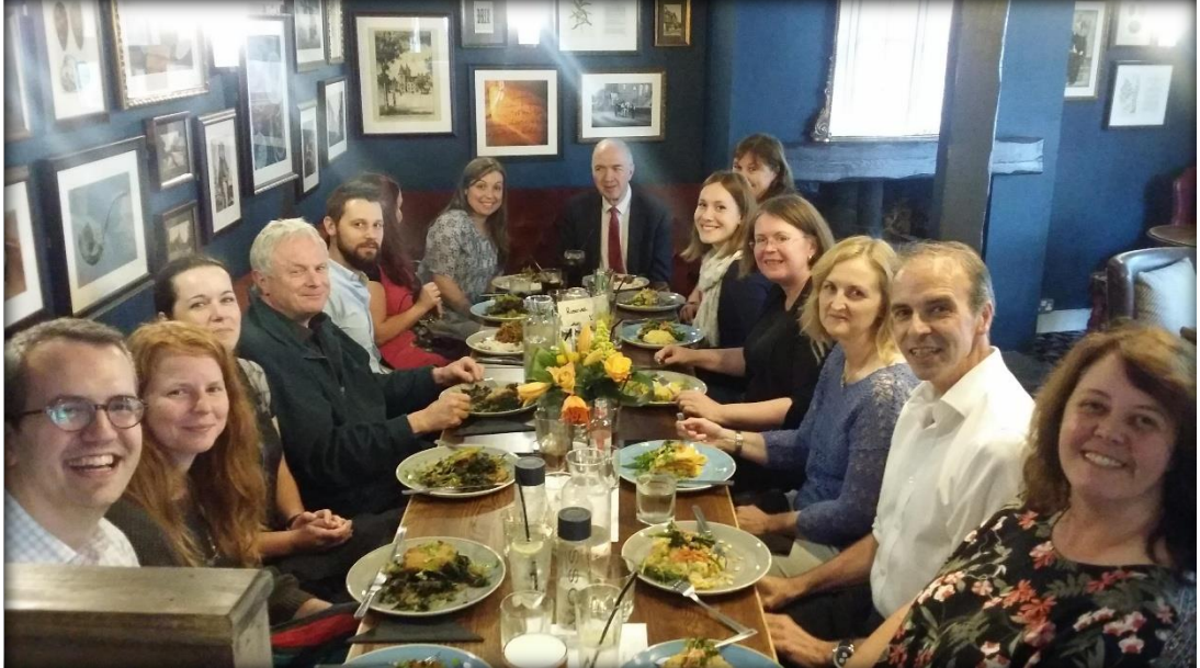
Vegan lunch with some colleagues at the restaurant The Red Lion in Godalming