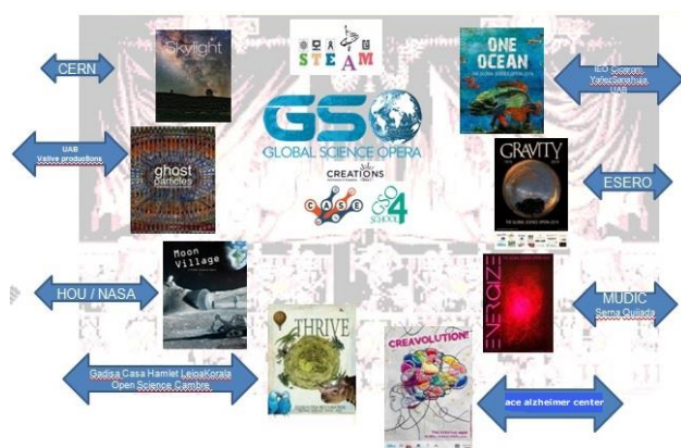
Figure 3. National and International Collaborations

National and International Collaborations in GSO Project (Fig.3). Collaborative interaction between participating schools and society guarantees the universality and training of citizens of the twenty first century.