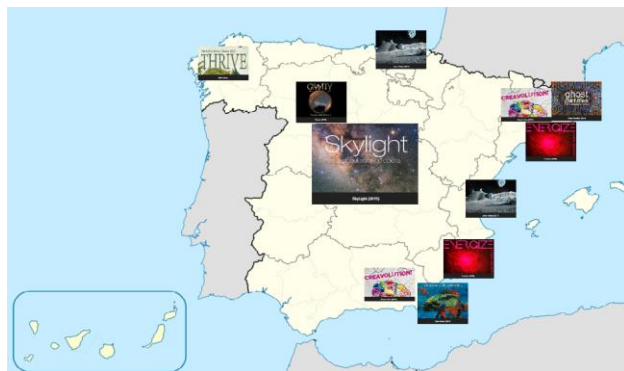
Figure 2. Global Science Opera Spain participation.

I present the productions since starting 2015. Eight editions in themes connected with events of the current year, with sustainability and more. The scenes created by Spain in successive editions with direct access are: Skylight, World's first Global Science Opera [4], Ghost Particles Quarks and Leptons [5], Moon Village A school on the Moon [6], One Ocean Being Scientist 2018 [7], Gravity Earth Gravity 2019 [8], Energize 2020 [9], Thrive Camino de Santiago [10], Creavolution 2022 [11]. This work, carried out in Spain in different schools of different autonomous communities of the country, offers a wide representation of the Spain students (Fig.2).