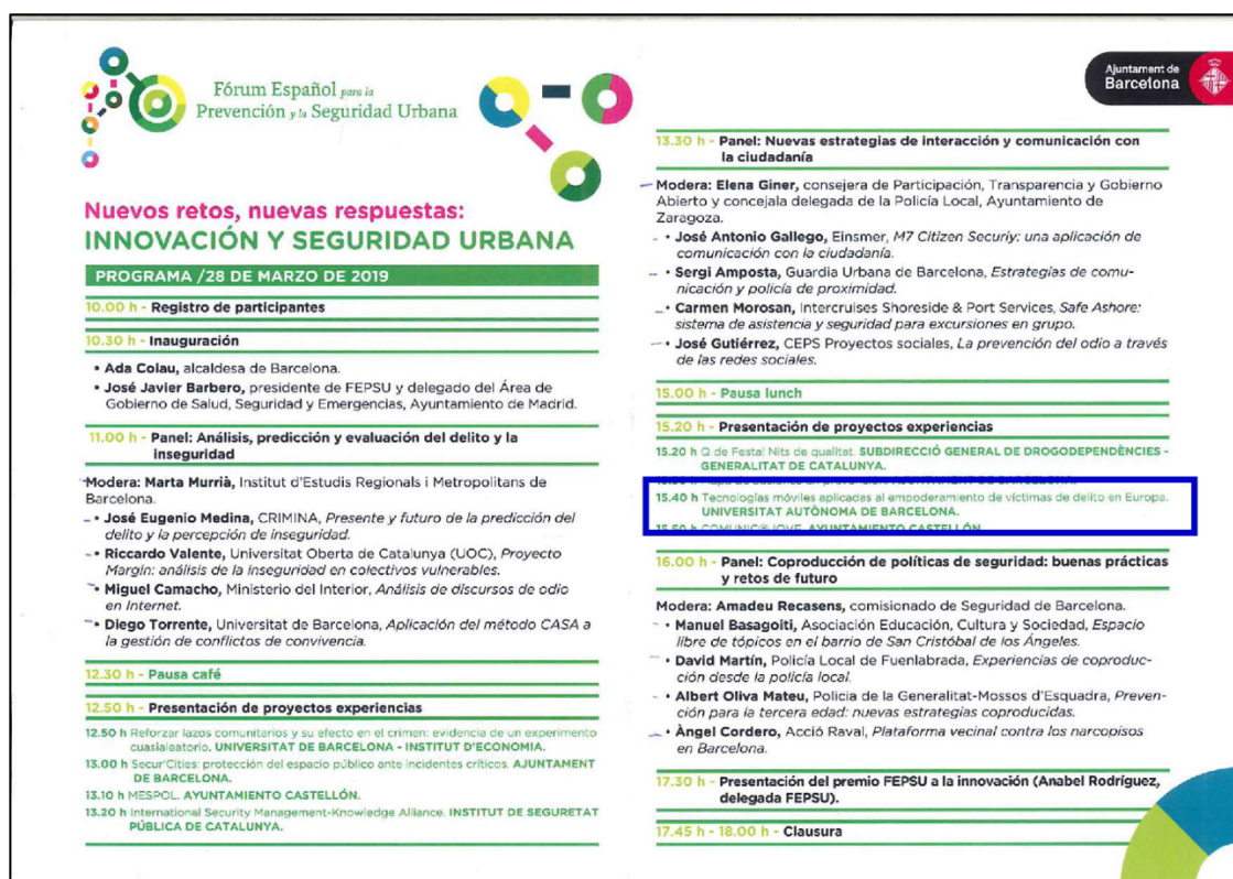
Figure 2: "New challenges, new answers: innovation and urban security" programme