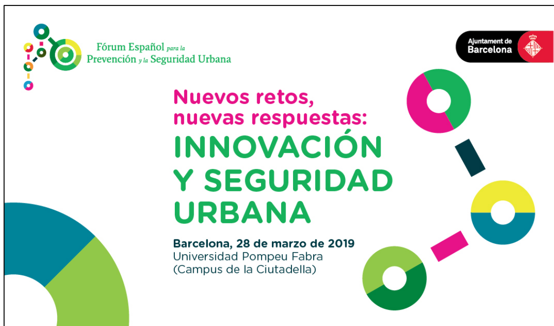
Figure 1: New challenges, new answers: innovation and urban security