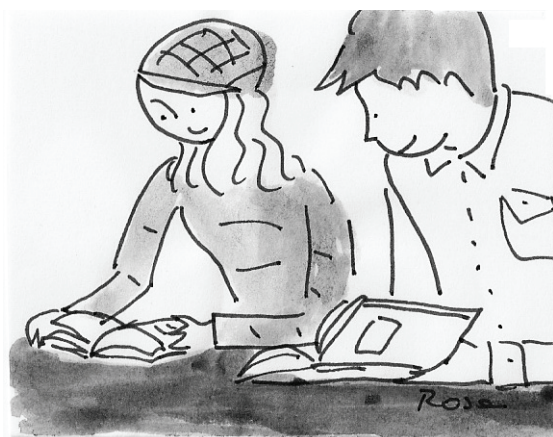
Rosa Ferreres (July 2012)

Universitat Autònoma de Barcelona Humanities Library Building L and B. 08193 Bellaterra (Barcelona) Tel.: 93 581 29 72