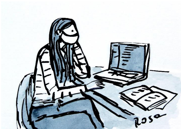
Rosa Ferreres (september 2020)