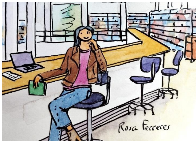
Rosa Ferreres (julio 2023)