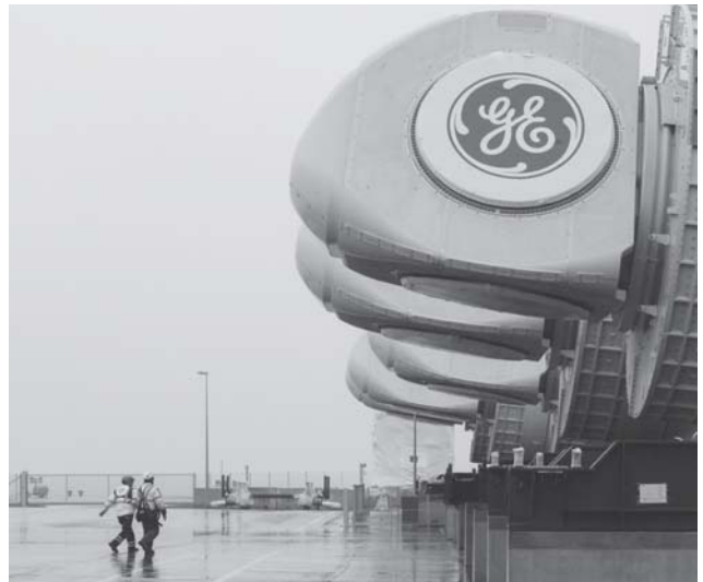
At Merkur Offshore Wind Farm, 66 Haliade 150-6 MW wind turbines will power a half million German homes.

We also need to run Power better, improving how we manage our inventory and material management, product development and delivery, and billings and collections. For example, by moving responsibility for collections closer to the customer relationship managers, Power was able to improve its visibility to cash and collect it earlier in the quarter. Where we used to get just 35 percent of our cash in the first two months of the quarter, in the fourth quarter, Power increased this to 50 percent. This kind of operational improvement takes hard work, and it is a multi-year journey, but I'm encouraged by the Power team's dedication and progress.