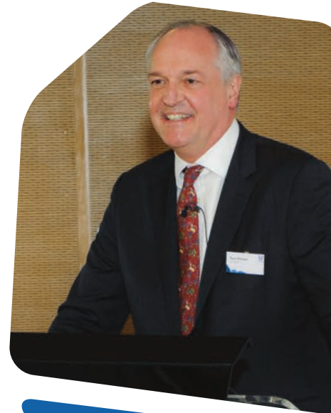
PAUL POLMAN, CEO