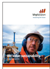
Sustainability Report 2012

The Sustainability Reporting Navigator 2012 indicates the sections of BHP Billiton's Sustainability Report, Annual Report and Summary Review that specifically address what we have done to address the GRI guidelines and uphold the 10 principles of the United Nations Global Compact and the International Council on Mining and Metals.