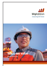
Summary Review 2012