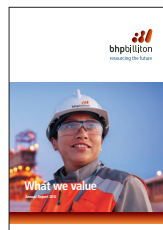
Annual Report 2012