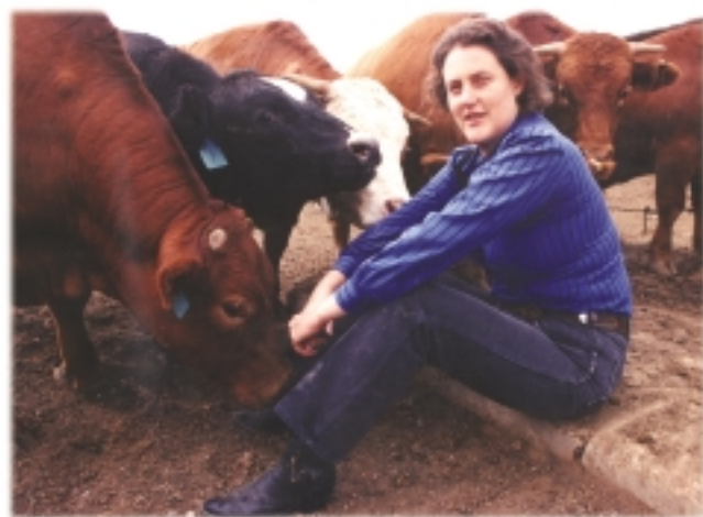
Dr. Grandin, Assistant Professor of Animal Science Colorado State University

"McDonald's integrating animal welfare into its quality assurance program has made a huge difference. I have been in this business for more than 25 years, and I have never seen such a transformation."