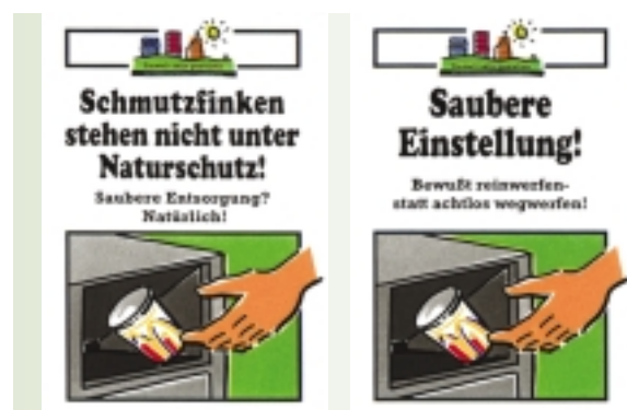
McDonald's Germany's posters encourage customers to clean up and not litter. Slogans include: "Have a clean attitude" and "Litter bugs are an endangered species."

To encourage environmental awareness and protection, McDonald's Japan has created a "Thank You Box" to separate their litter. It includes clearly identified illustrations so customers can separate and dispose of plastic garbage, trash other than plastic, and beverages with ice.