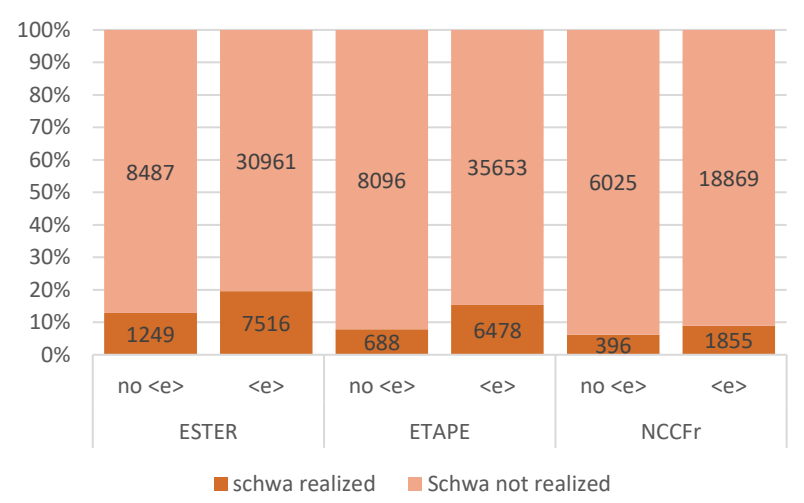
Figure 2. Realization of word-final schwa as a function of orthography by corpus