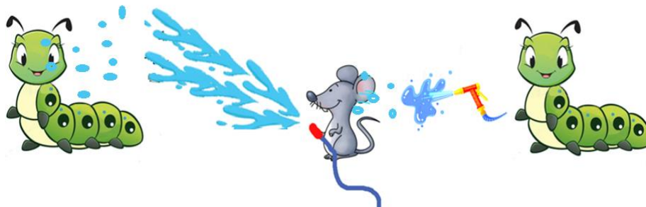
Figure 1. Example of images used to assess comprehension of object relative clauses with a 3 rd -person pronoun subject.